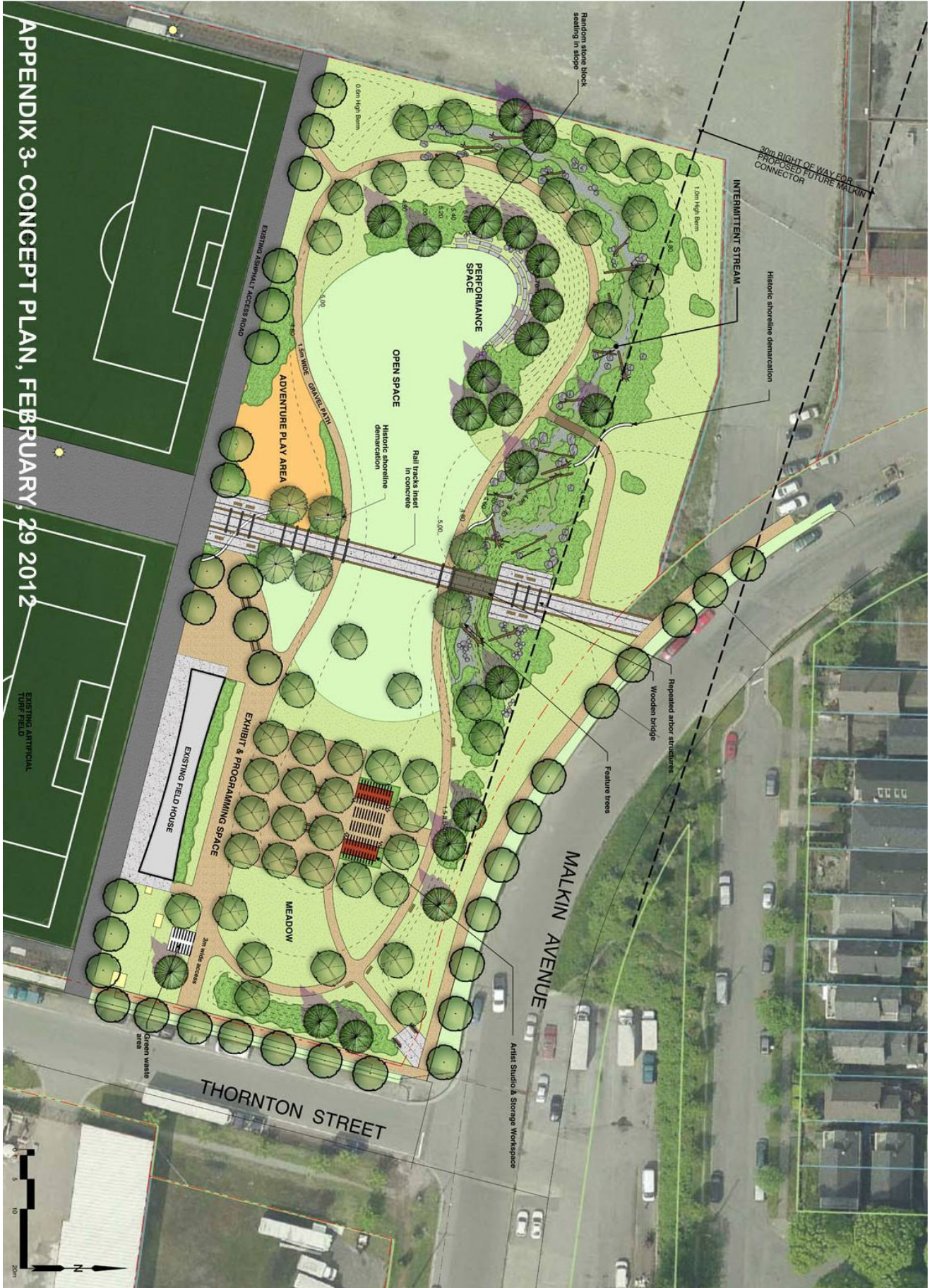
APPENDIX 3- CONCEPT PLAN, FEBRUARY, 29 2012