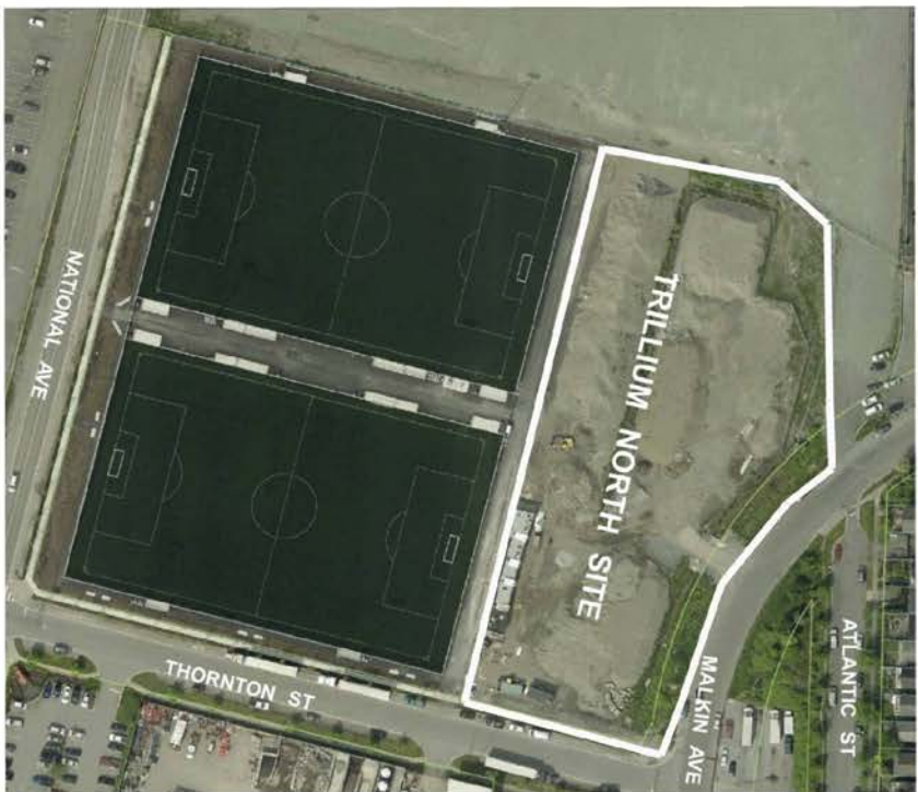
APPENDIX 1- TRILLIUM NORTH SITE AND CONTEXT MAP