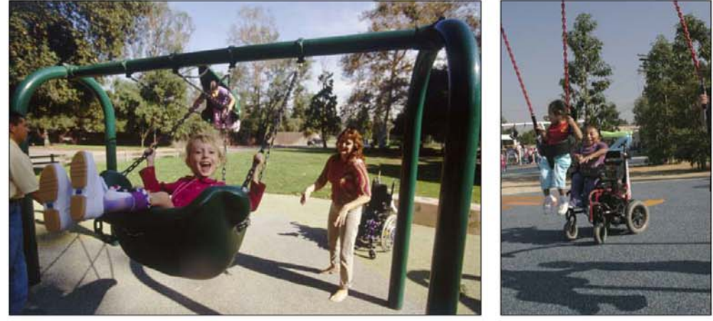
Swings - 2-belt swings and 2- molded high back swings. The molded high back swings allow children with low muscle tone to enjoy the thrill of soaring into the air.