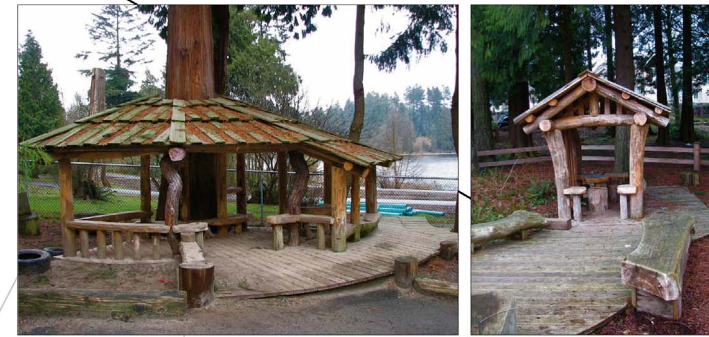
Wooden Tree House, accessible - by local artist provides imaginative fun, with natural materials to include slide and climber as well as bench and counter.