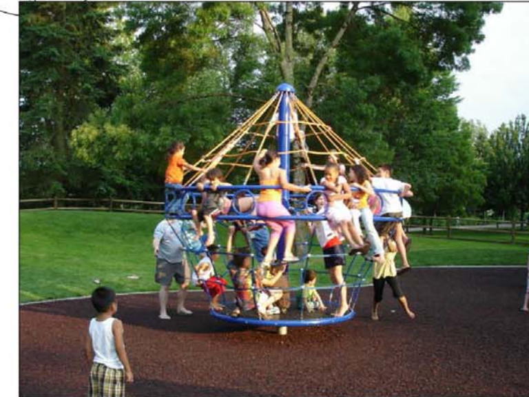
Rotating Climber - allows multiple children to gather, cooperate, climb, spin, push and pull. The bottom of the rotating climber is solid which will allow a child with low muscle tone or other disabilities to enter the climber and lay or sit on the bottom while experiencing the spinning sensation.