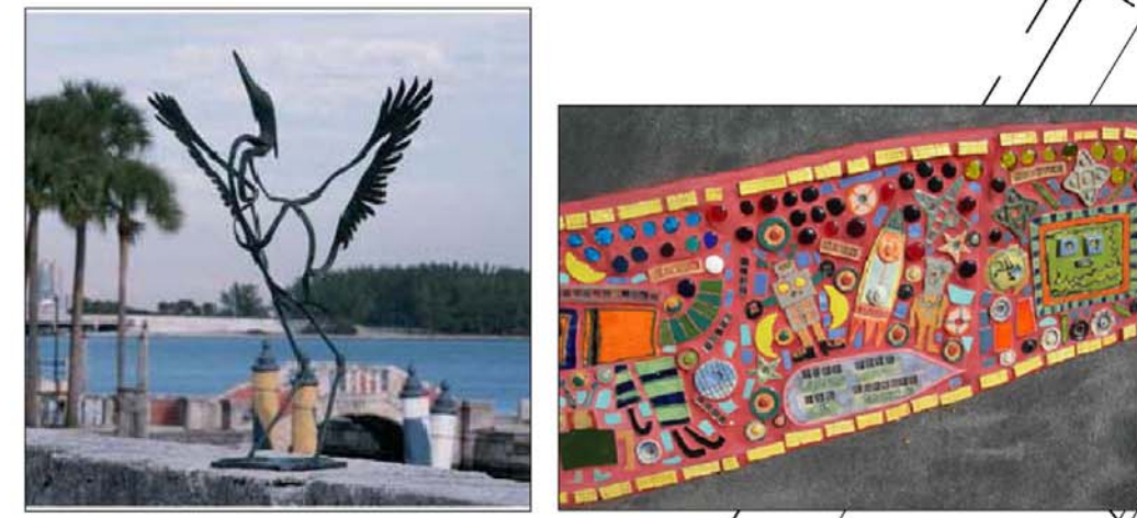
Community Art - The walls of the raised sensory garden as well as the center of central sensory garden in the plaza are opportunities for community or children's art.