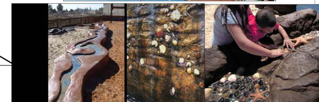
Boat/Sand/Water Experience, accessible - This small boat will include a steering wheel, talk tubes to communicate with the tree house and texture provided by barnacles, starfish, shells and pebbles. A small trickle of water will be activated by a button on a timer and will flow around the back of the boat overflowing into the sand creating the perfect sensory experience. A cooperative opportunity is provided as the children in the sand cooperate with the children inside the boat to keep the water flowing.