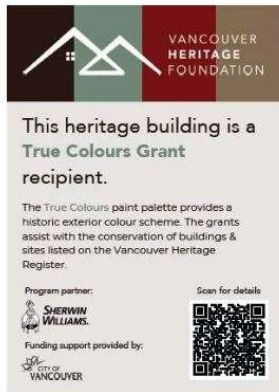
Projects Signs (re-designed 2023)