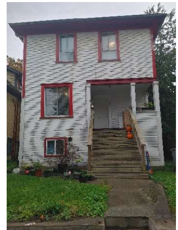
Upcoming Projects from October & February Intakes (Year Seven): True Colours historical re-painting(left), door restoration (centre), new roofing (right)