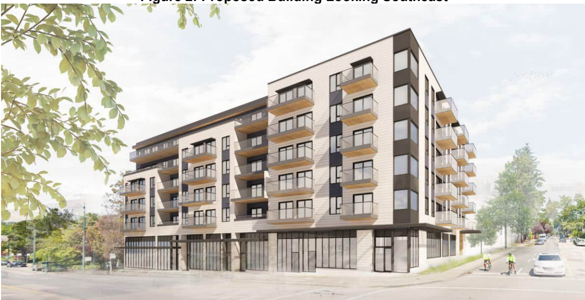
Figure 2: Proposed Building Looking Southeast

The proposal is for a six-storey mixed-use building with 100 market rental units and ground floor commercial space (Figure 2). A building height of 24 m (78.7 ft.) and a floor space ratio (FSR) of 3.9 are proposed. Two levels of underground parking are to be accessed from the lane.