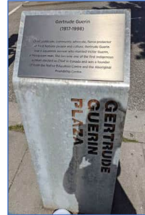
Gertrude Guerin Plaza