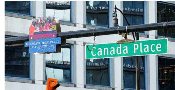
Guru Nanak Jahaz Place