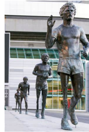
Terry Fox Memorial