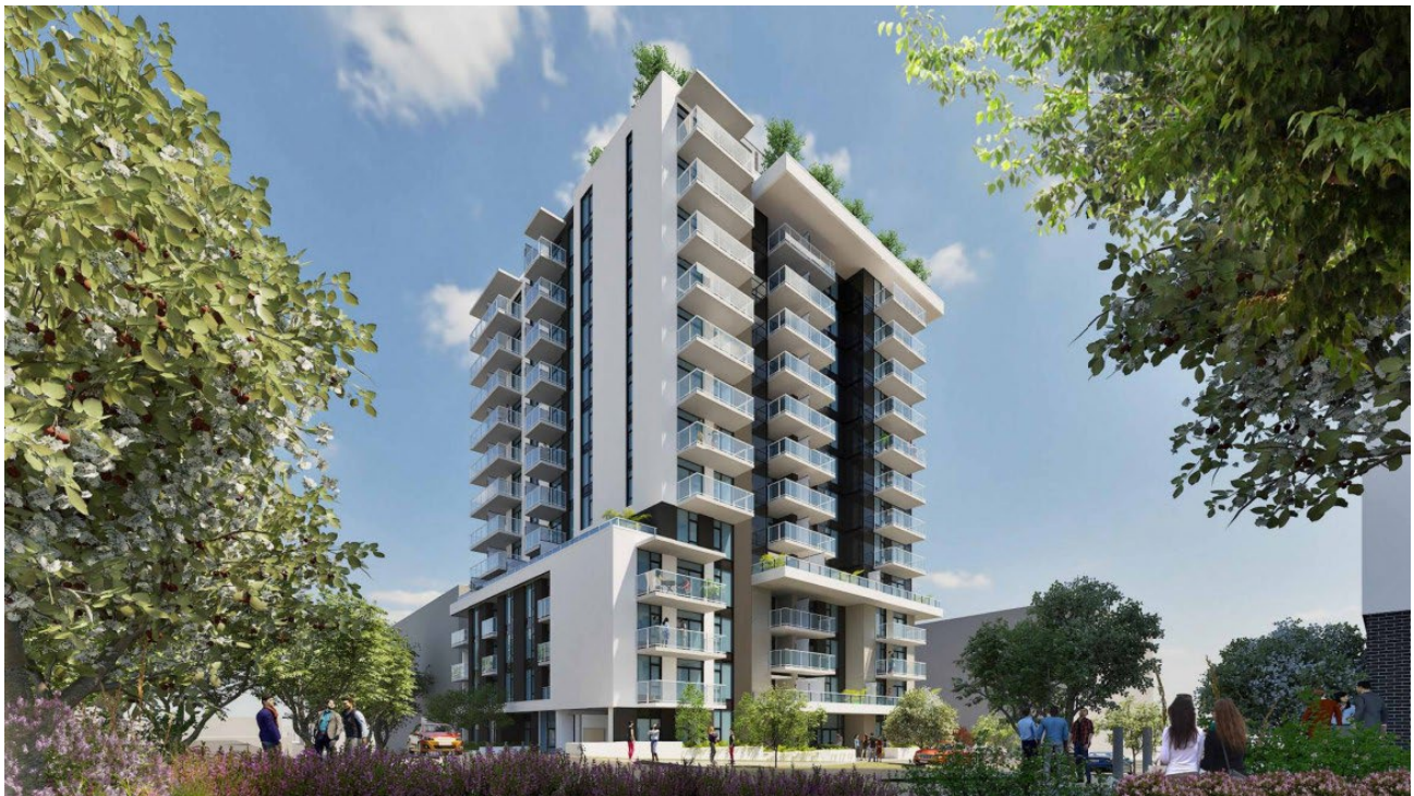
Figure 2: Proposed Building Looking Northeast

The proposed rezoning is for a 13-storey residential building with 131 rental units, of which 10% of the residential floor area (approximately 14 residential units) would be secured as below-market units. A height of 39 m (127 ft.) with additional height for a portion with rooftop amenity and a density of 6.76 FSR are proposed. Three levels of underground parking are to be accessed from the lane.