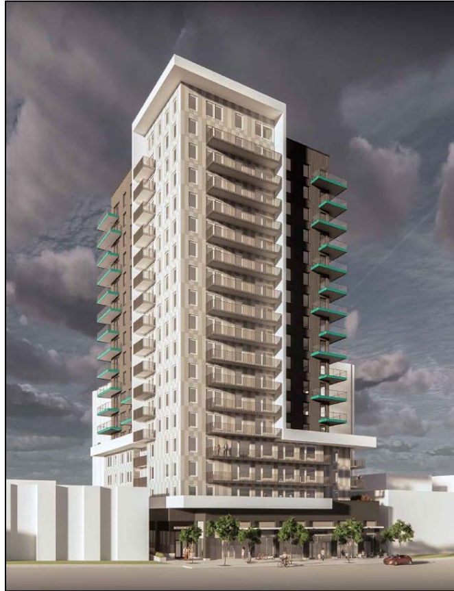
Figure 2: Proposed Building Looking Southwest

The proposal is for a 17-storey mixed-use residential building with additional height for a rooftop amenity space, and includes 160 rental units of which a minimum of 20% of the residential floor area is for below-market units (Figure 2). Ground floor commercial uses are proposed fronting onto West 11th Avenue. A building height of 60.2 m (198 ft.) and a floor space ratio (FSR) of 6.8 is proposed. Three levels of underground parking are to be accessed from the lane.