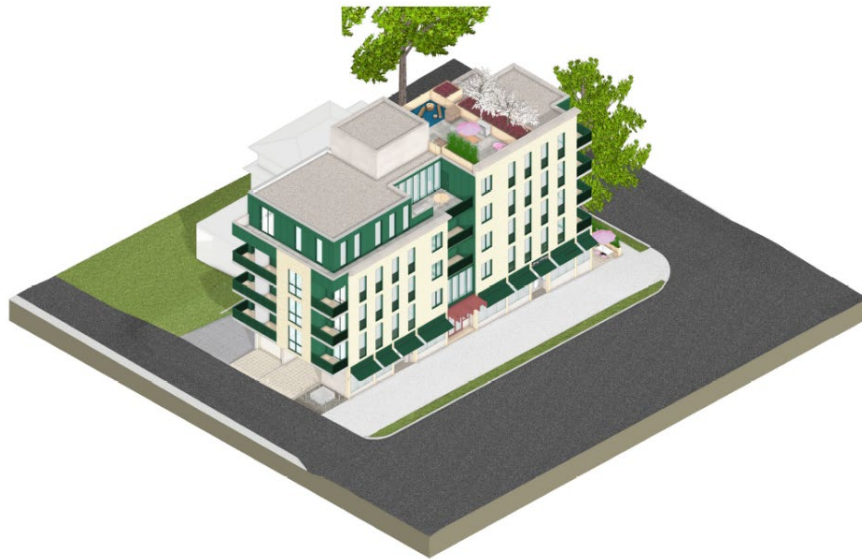
Figure 2: Proposed Building Looking Northwest

The proposal is for a five-storey mixed-use building with 23 rental units and two commercial retail units (CRUs) on the ground floor (Figure 2). This proposed building has a maximum height of 19 m (62 ft.) with additional height for a rooftop amenity, and an overall maximum density of 2.80 FSR. The proposal includes one level of underground vehicle and bicycle parking, which is accessed from the rear lane.