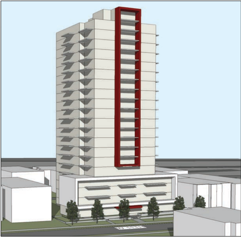
PERSPECTIVE FROM NORTHEAST