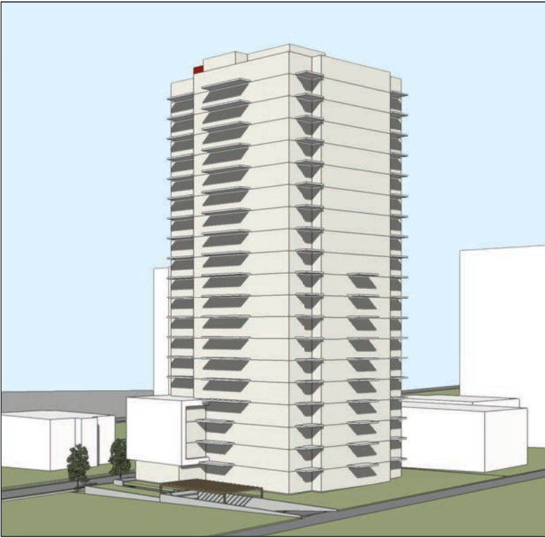
PERSPECTIVE FROM SOUTH