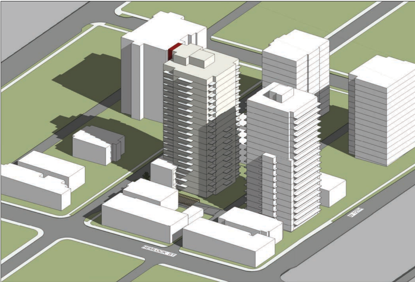
AXONOMETRIC FROM SOUTHWEST