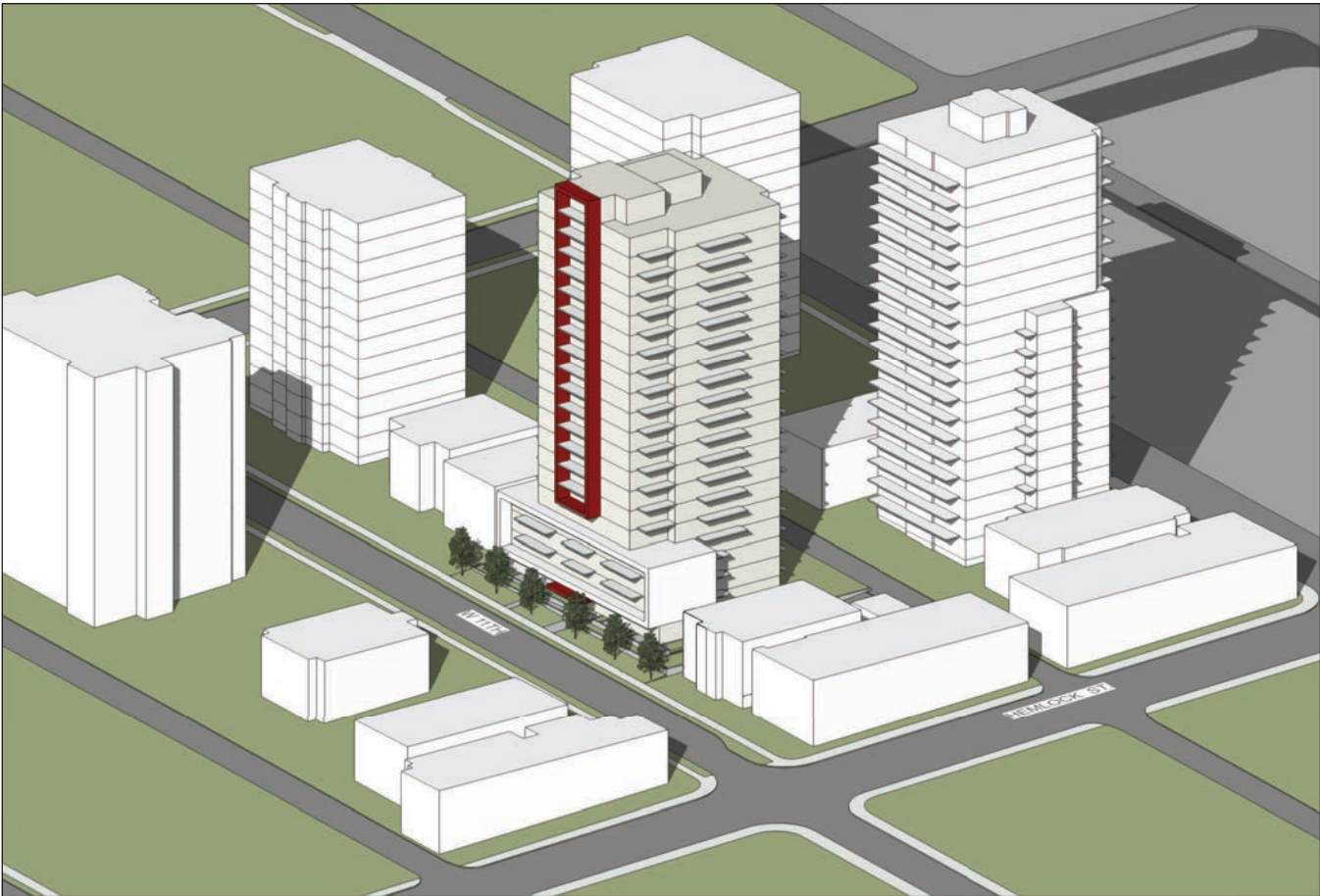
AXONOMETRIC FROM NORTHWEST