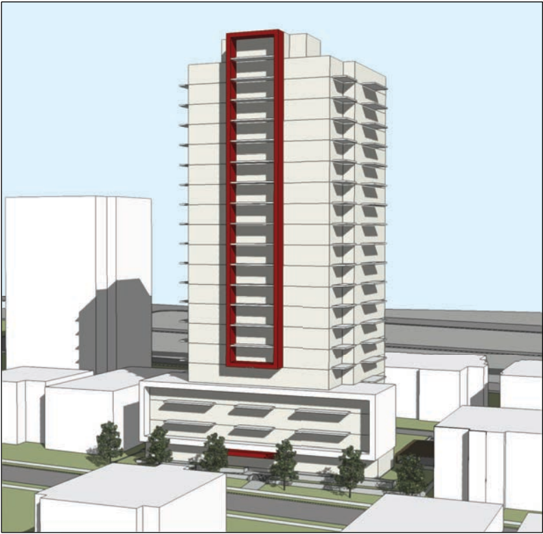
PERSPECTIVE FROM NORTHWEST