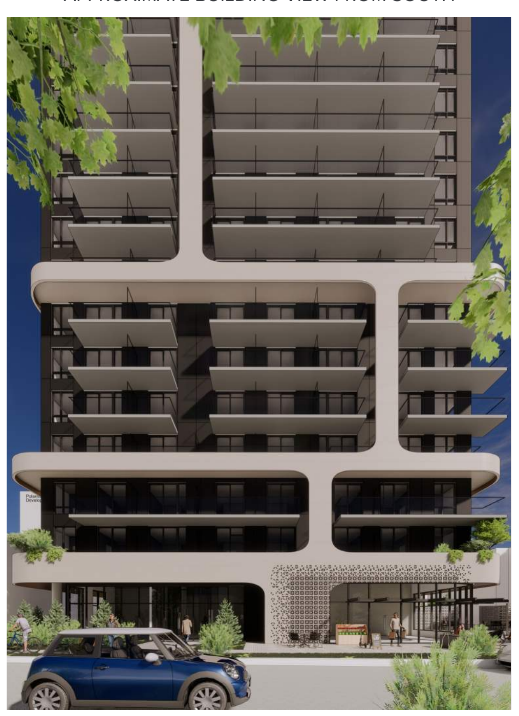
APPROXIMATE BUILDING VIEW FROM SOUTH