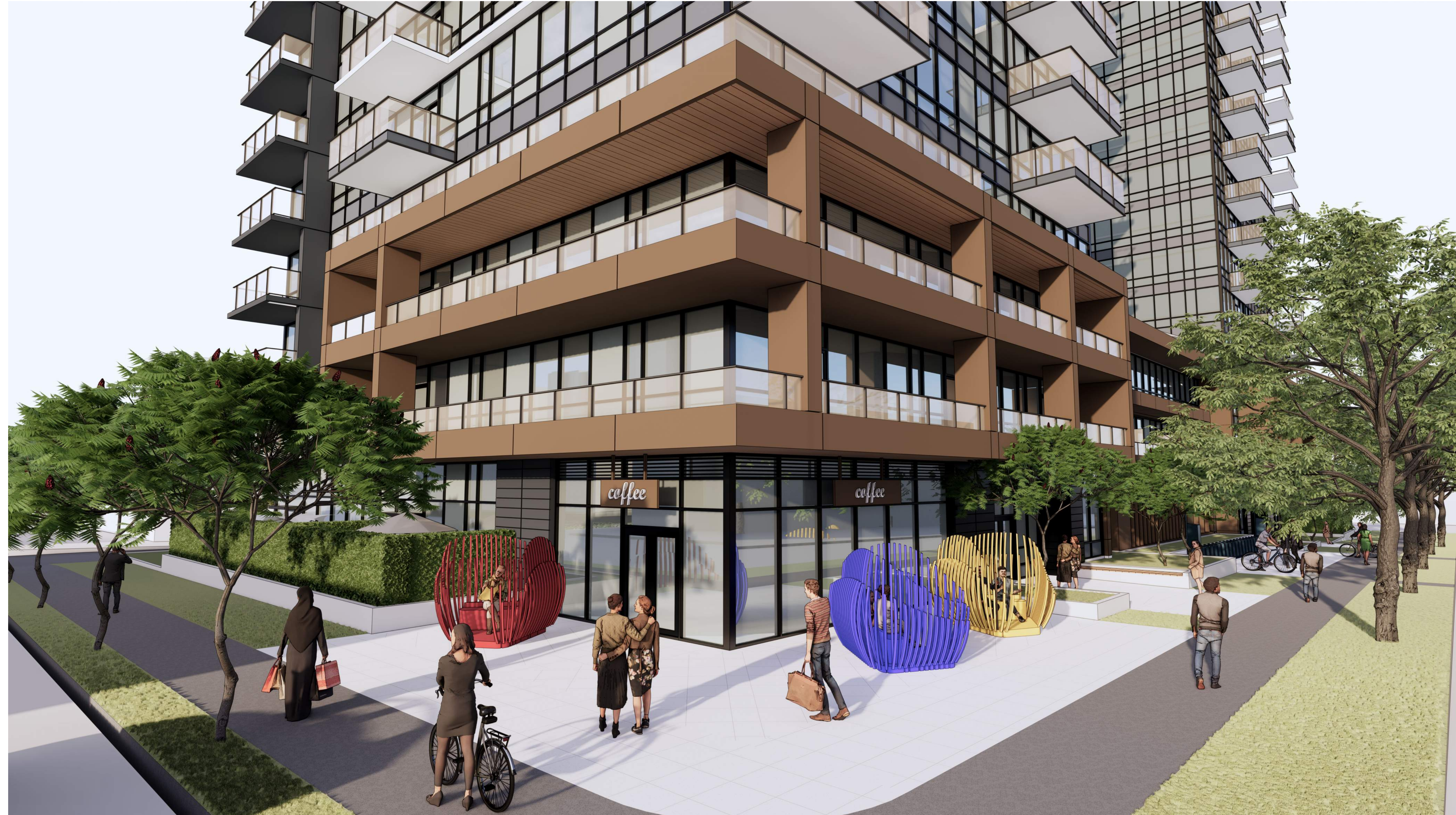
VIEW FROM NORTH-EAST CORNER SHOWING PUBLIC ART & CRU ENTRY