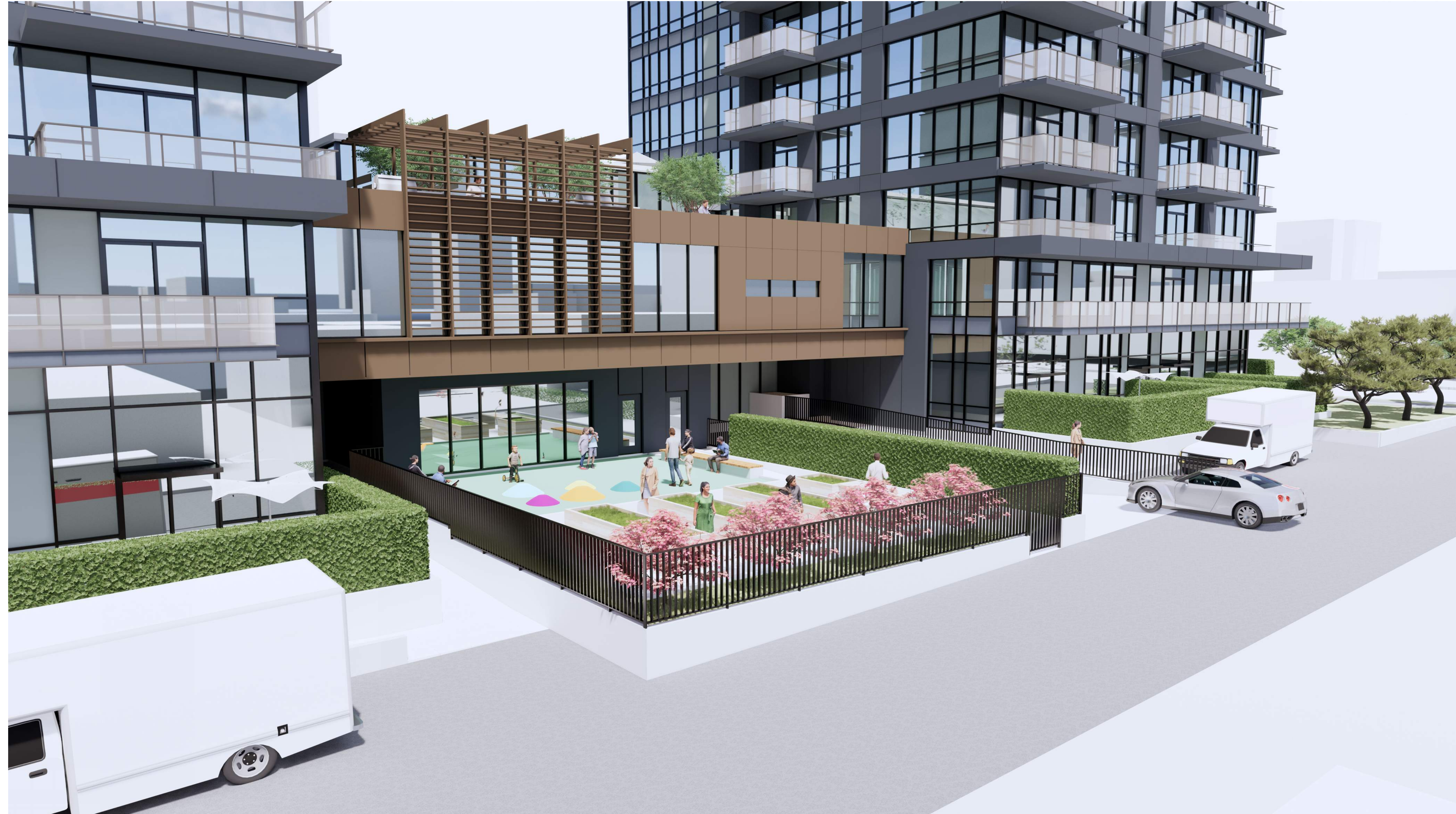
VIEW FROM LANE SHOWING PARKING ENTRANCE, LOADING AREAS AND OUTDOOR AMENITIES