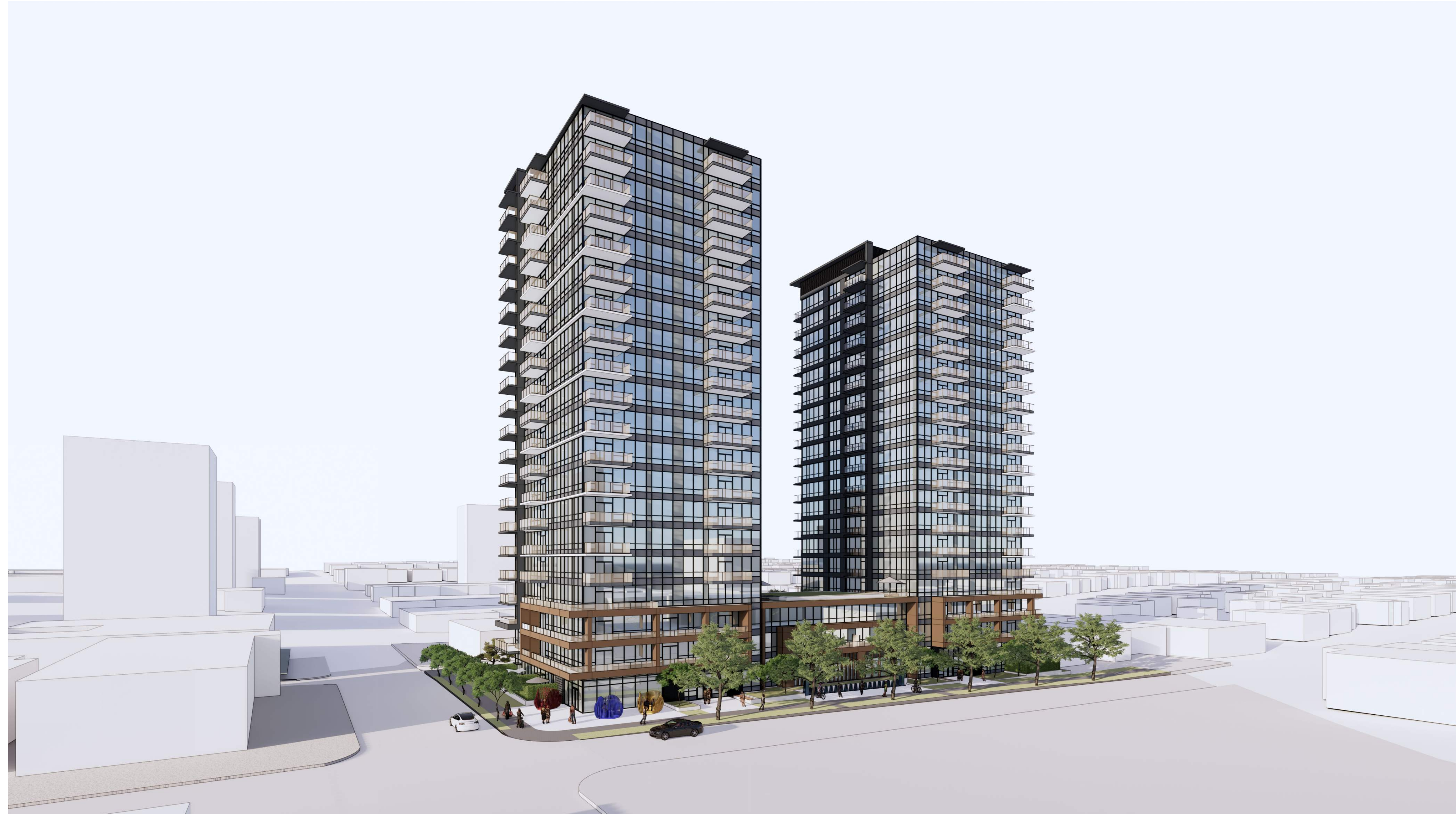
OVERALL VIEW FROM NORTH-EAST CORNER