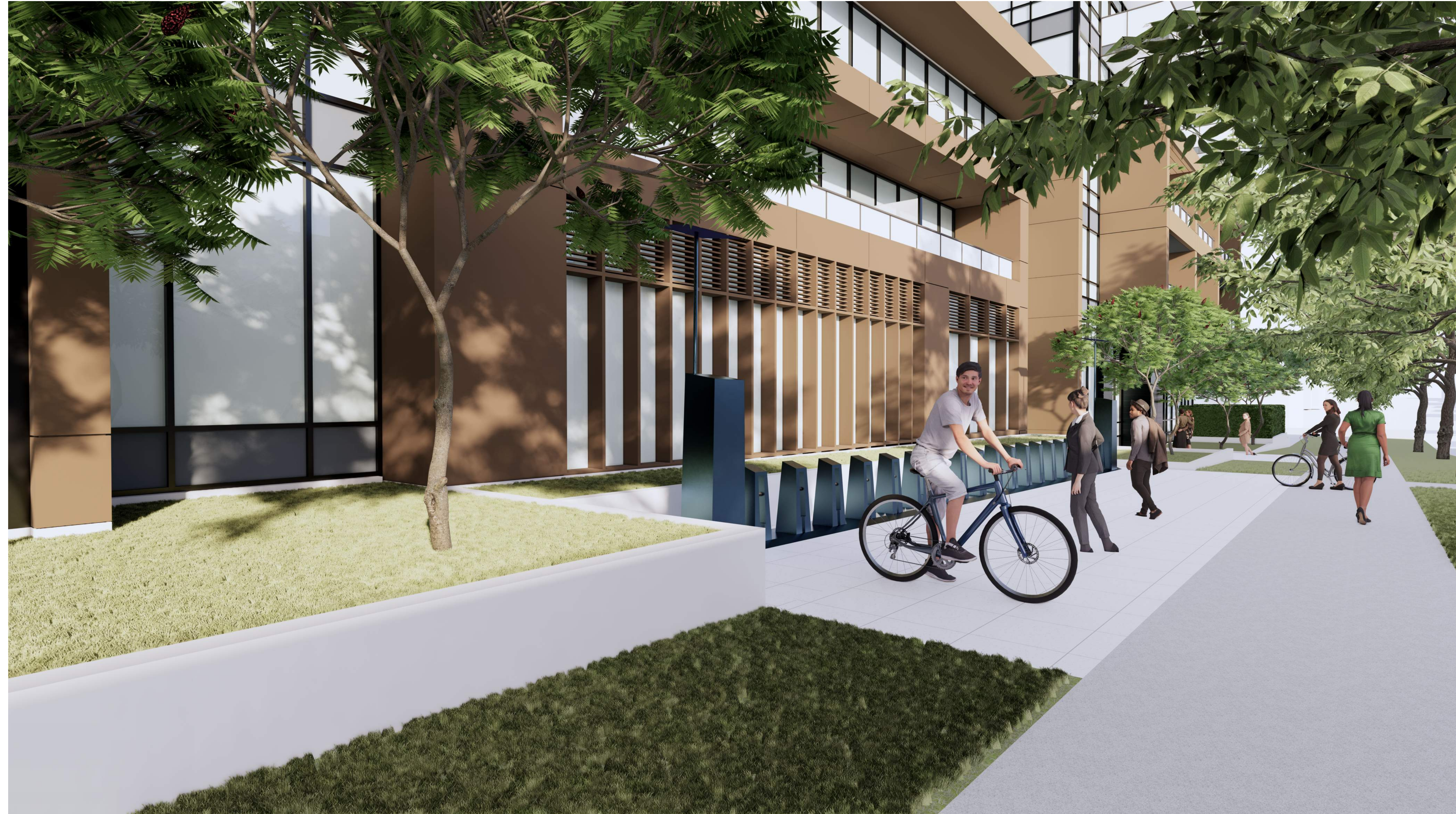
VIEW FROM NORTH SIDEWALK SHOWING PUBLIC BIKE SHARE