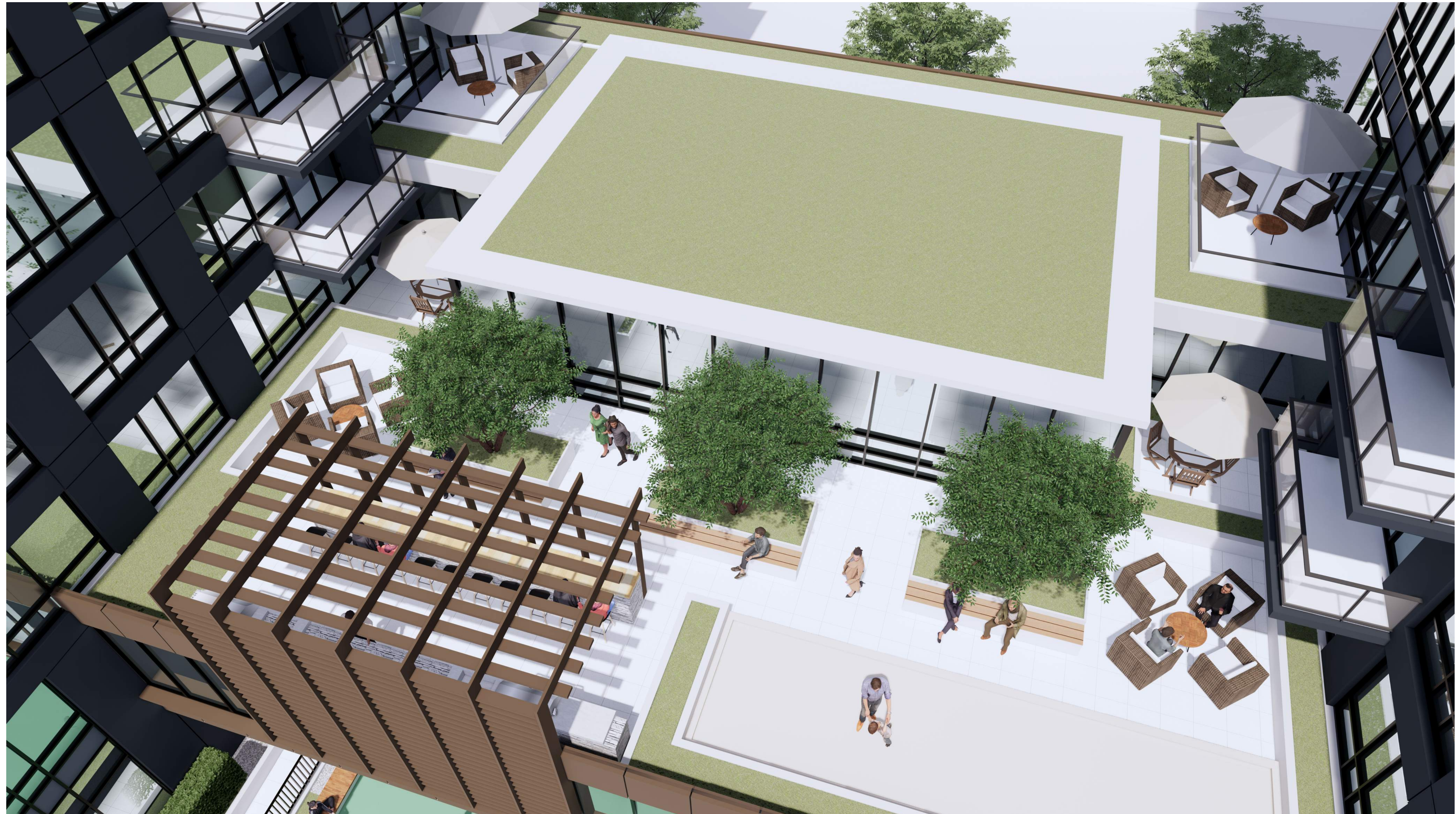
VIEW FROM EAST TOWER BALCONY OVERLOOKING OUTDOOR AMENITY ON LEVEL 3 & PRIVATE DECK/GREEN ROOF ON LEVEL 4