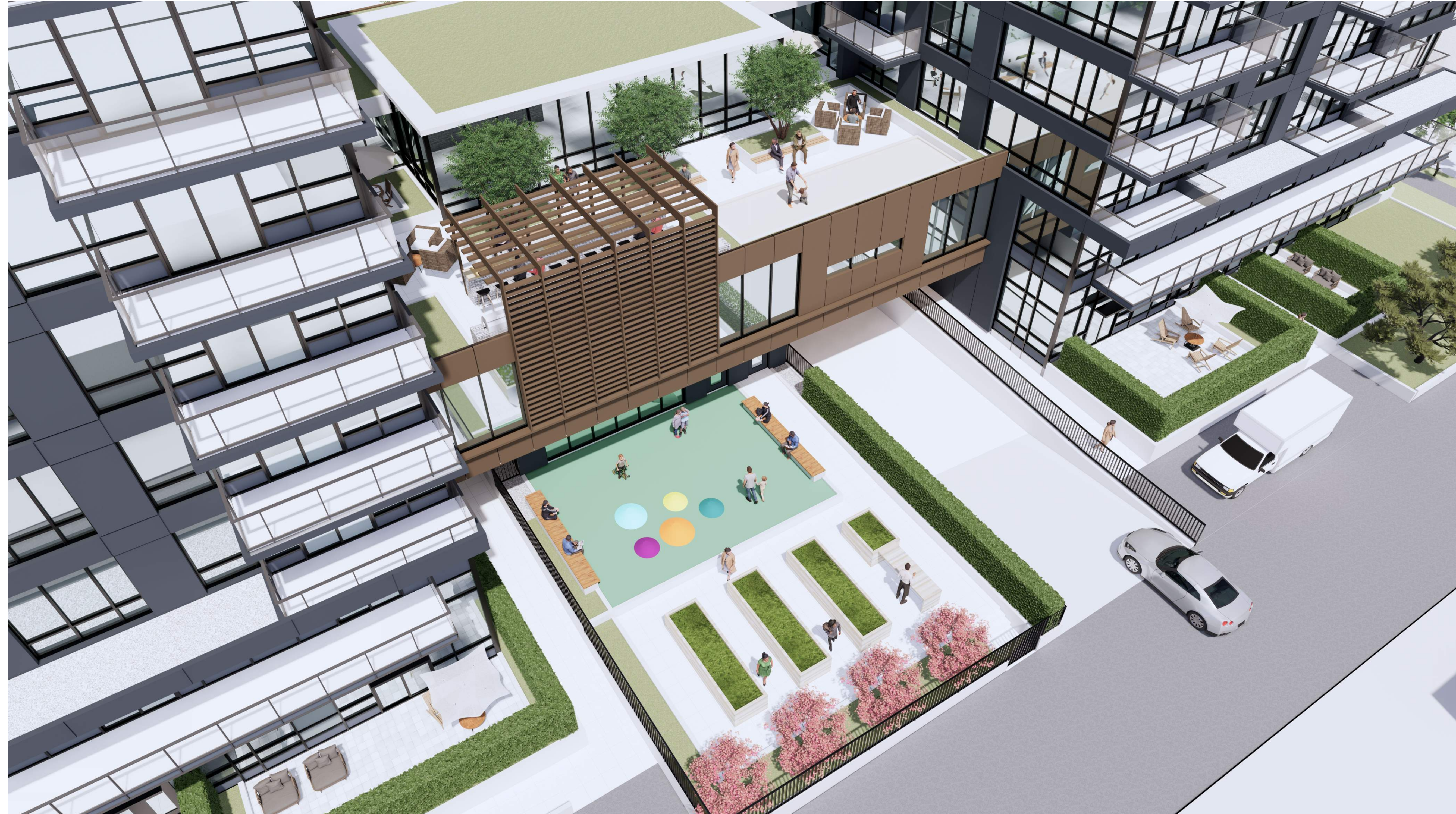
VIEW FROM SOUTH-WEST CORNER SHOWING OUTDOOR AMENITY AREAS ON GROUND & ON LEVEL 3