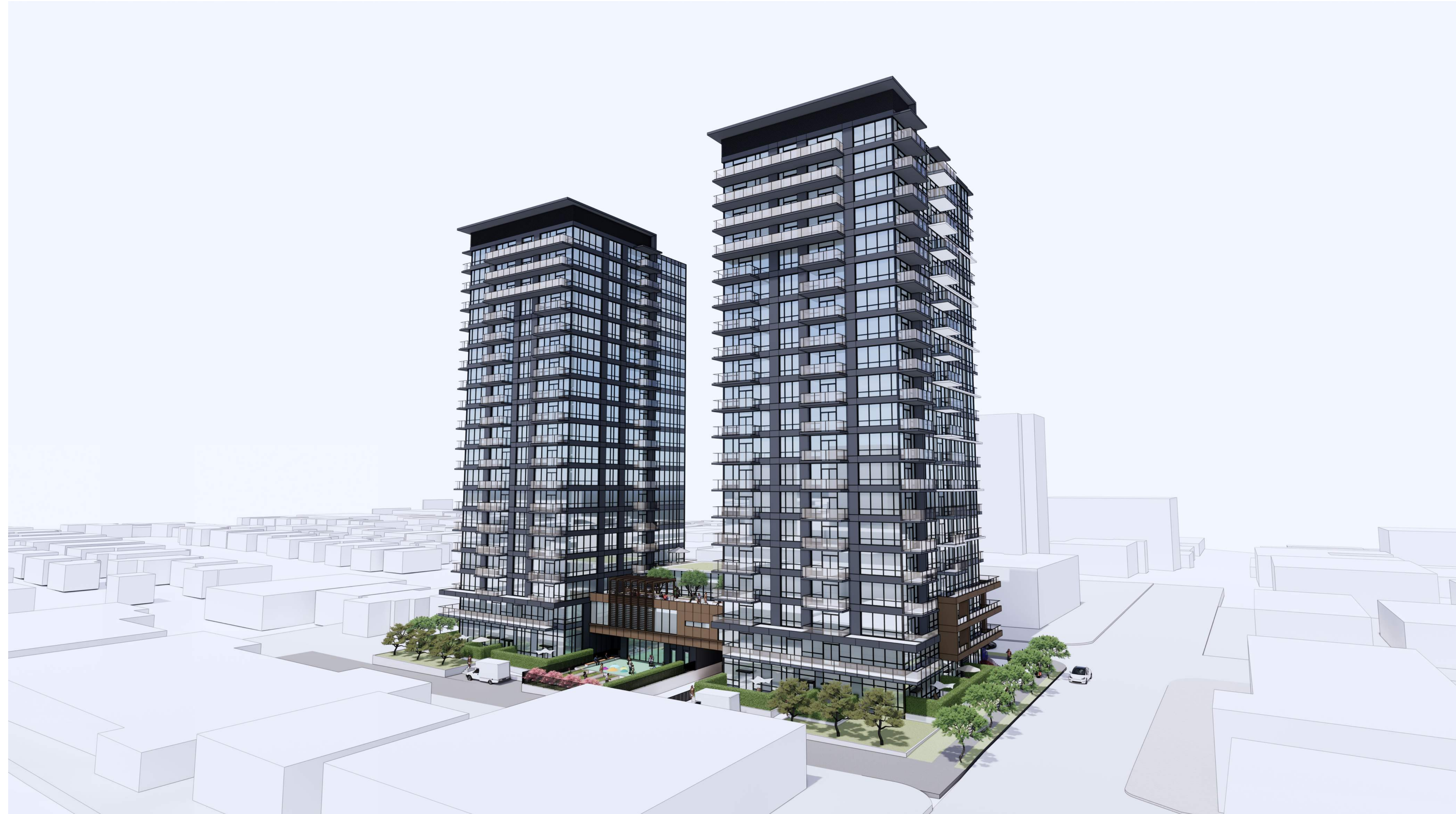
OVERALL VIEW FROM SOUTH-EAST CORNER