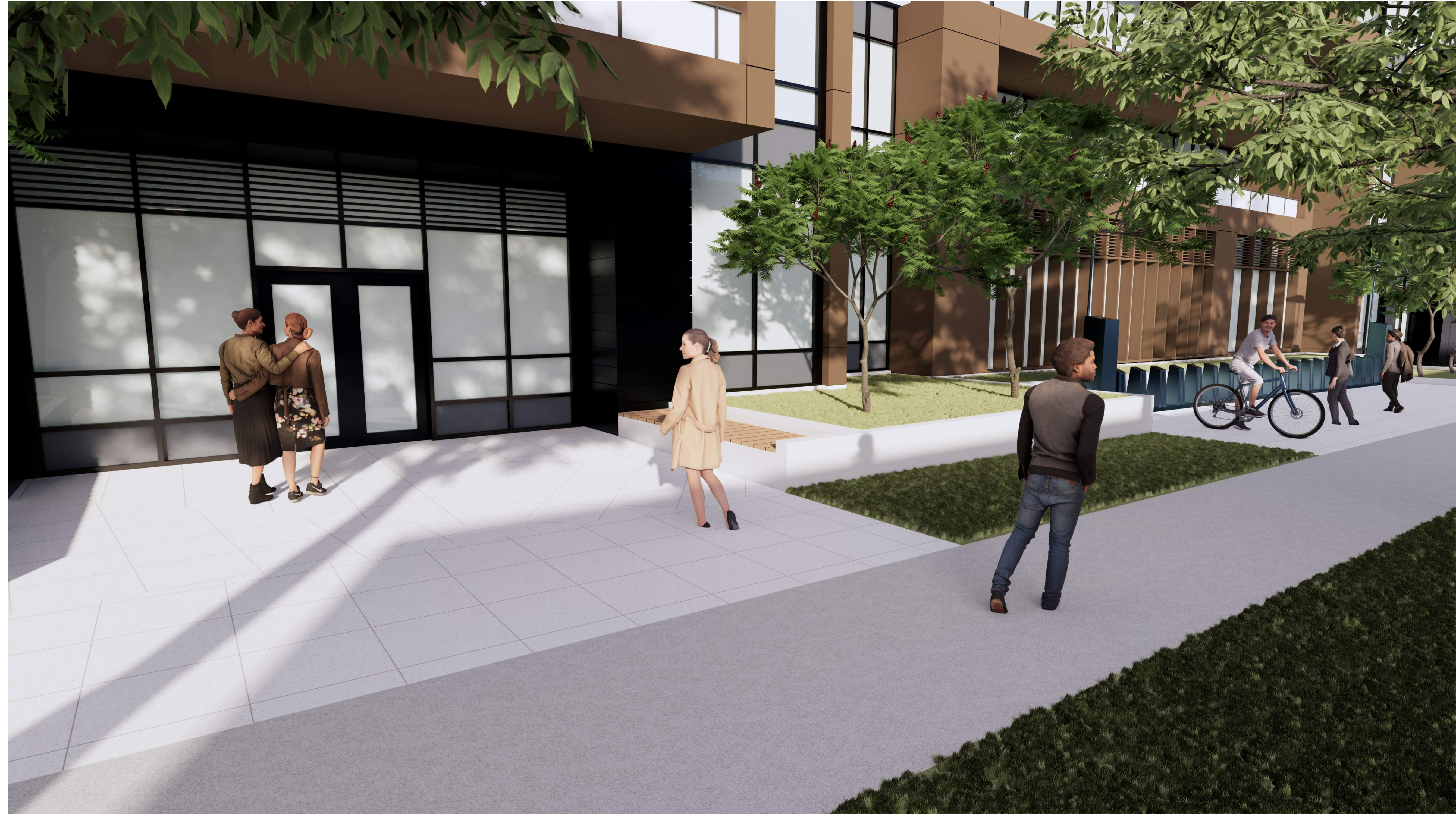
VIEW FROM NORTH SIDEWALK SHOWING EAST TOWER ENTRY