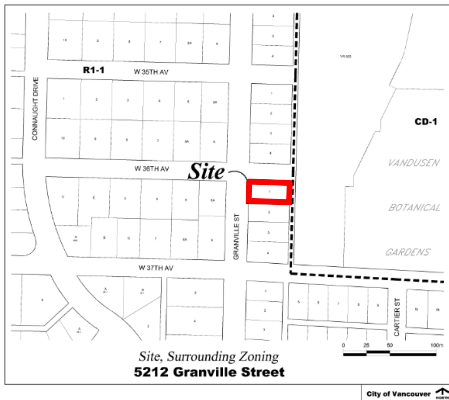
Figure 1: Location Map – Site and Context

This property and the properties to the north, west and south are zoned for residential uses under the R1-1 District Schedule. Townhouses and the VanDusen Botanical Garden are located to the east and zoned CD-1. The site is developed with a single-detached home constructed in 1939 and the property is not listed on the Vancouver Heritage Register . The property contains no rental tenancies and the tenant protection policy does not apply.