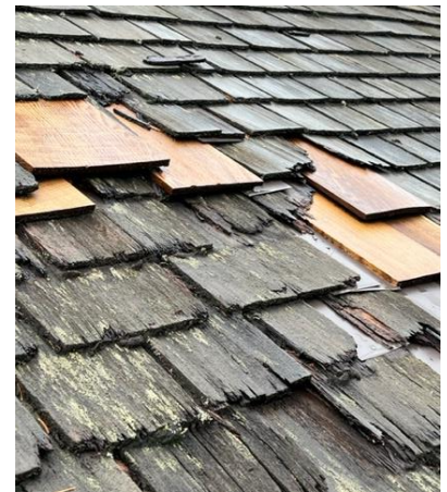
Upcoming Projects from October & February Intakes (Year Five): Window repair and façade rehabilitation (left), Water remediation (centre), Roofing replacement (right)