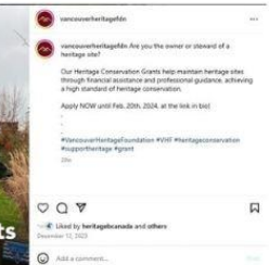
Projects Signs (re-designed 2023)