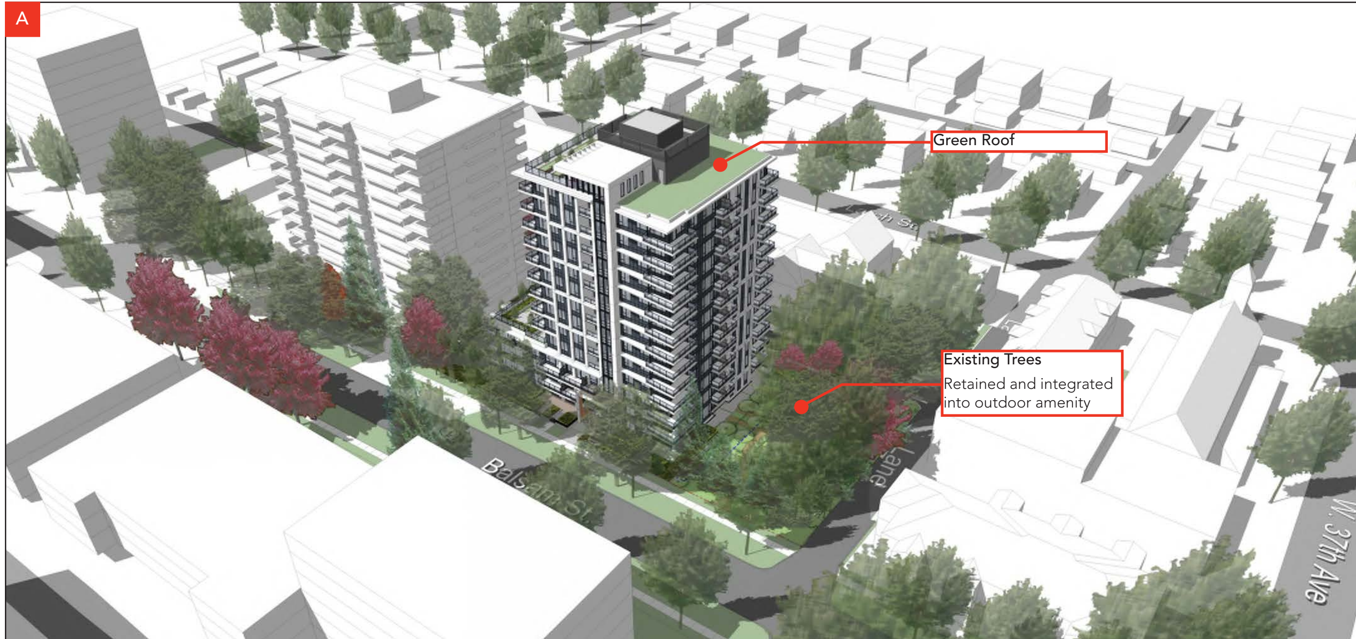
NORTH EAST CORNER