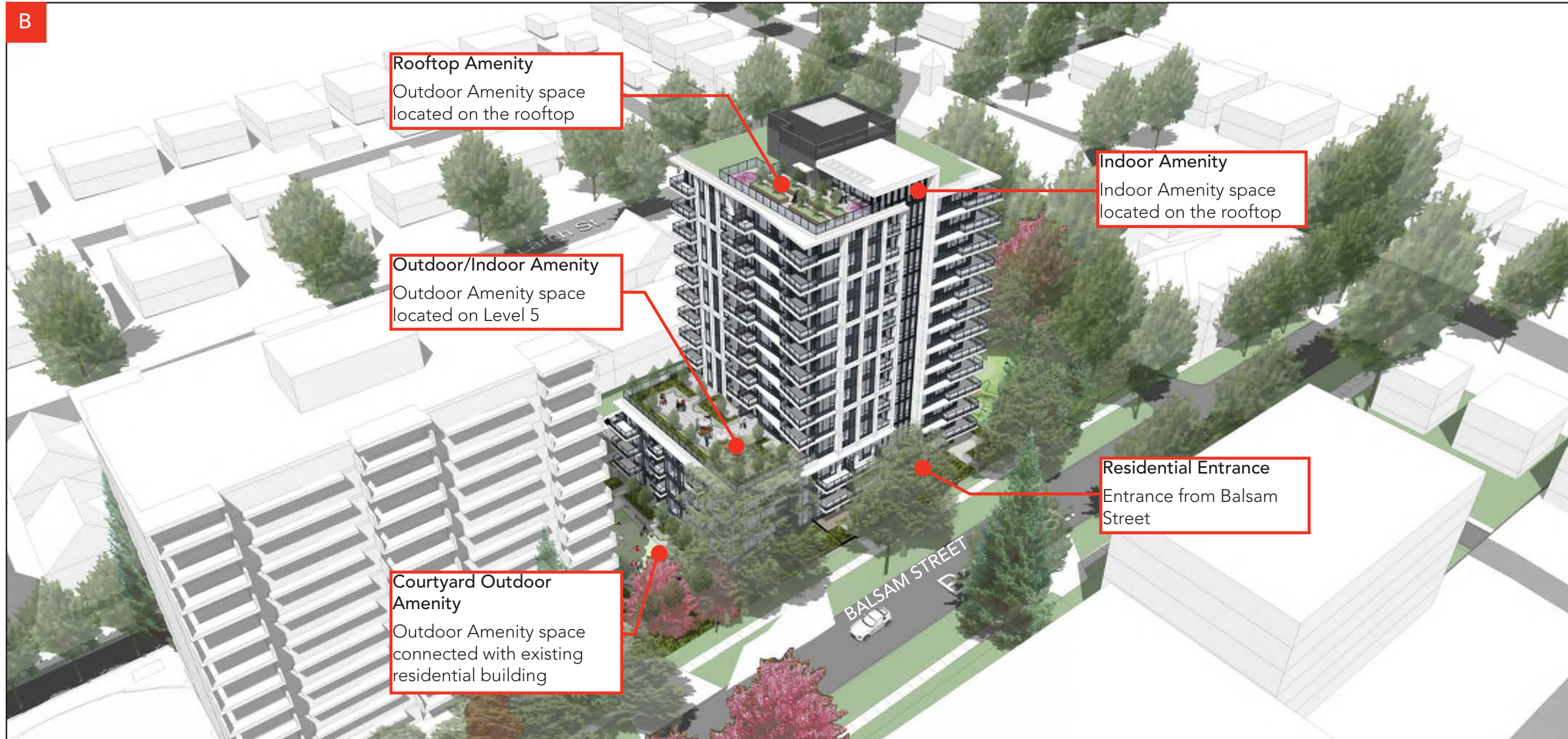
SOUTH EAST CORNER