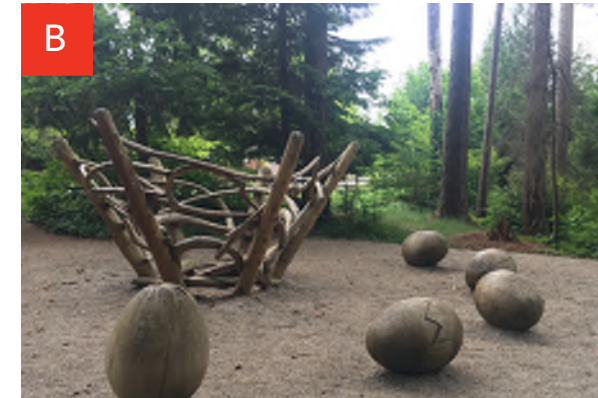
NATURE PLAY PRECEDENT