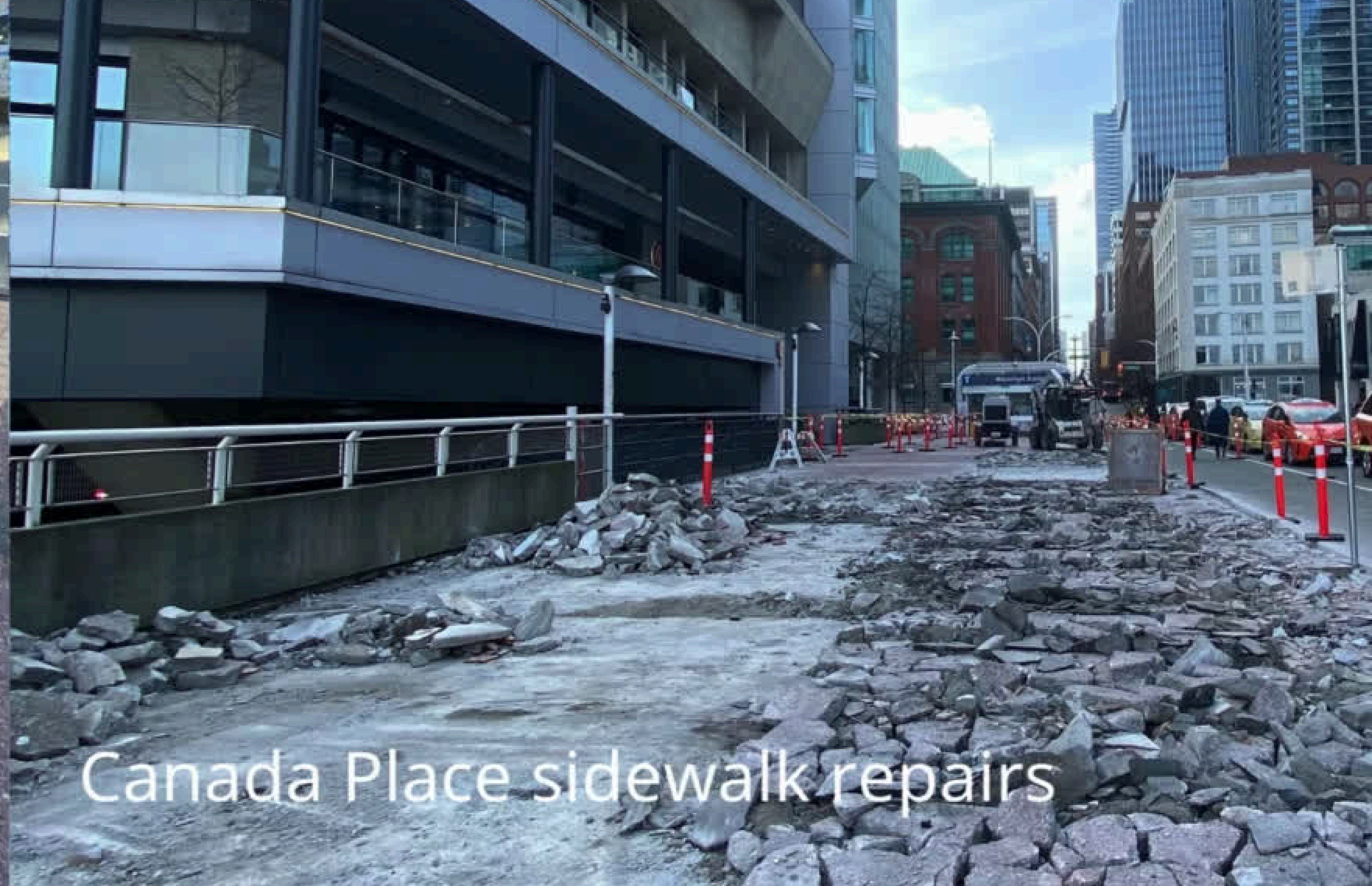
Canada Place sidewalk repairs

Prioritizing safety upgrades & critical repairs to enhance the experience for pedestrians & cyclists