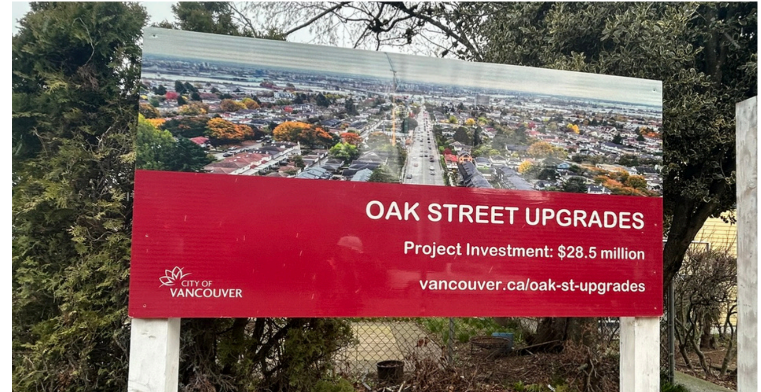
Signage at project sites in the community

A $50 million investment that will transform the way we use the Granville Bridge by converting 2 travel lanes to walking, rolling, and cycling.