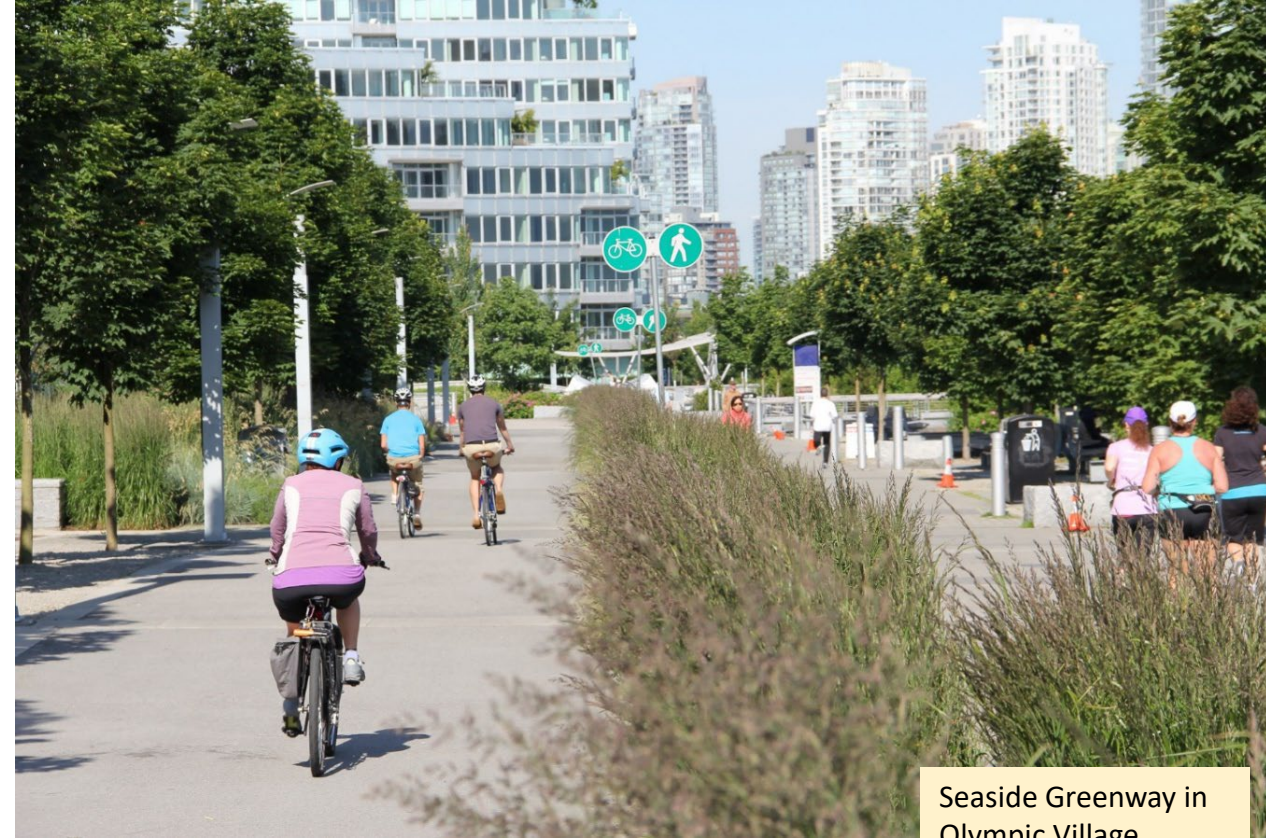
Seaside Greenway in Olympic Village