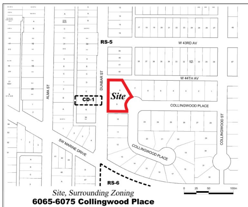
Figure 1: Location Map – Site and Context

This property and the surrounding area are zoned for residential uses under RS District Schedules with a CD-1 directly adjacent that is being used for residential rental purposes. There is a pedestrian path directly south of the site connecting Dunbar Street and Collingwood Place.