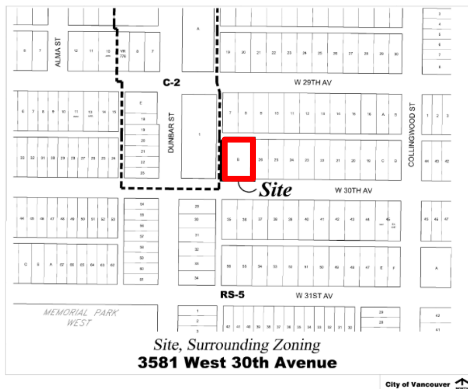
Figure 1: Location Map – Site and Context

This property and the surrounding area are zoned for residential uses under RS District Schedules with the exception of the C-2 area to the west that allows mixed-use development with commercial and residential uses. The site is currently zoned RS-5 and is being used as a surface parking lot. The property contains no rental tenancies and the tenant protection policy does not apply.