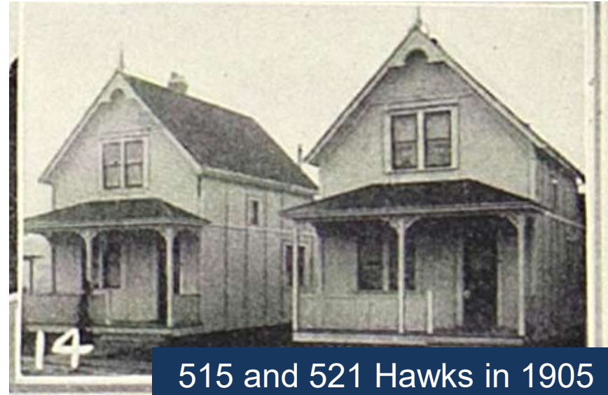
515 and 521 Hawks in 1905