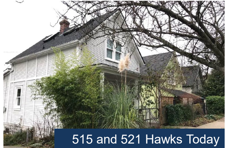
515 and 521 Hawks Today