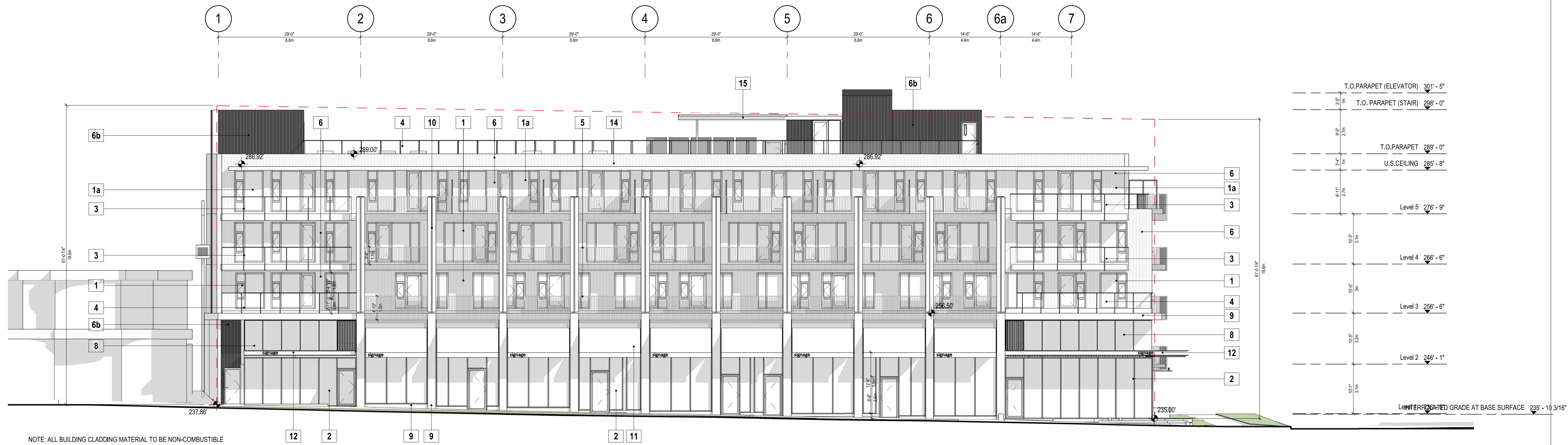
1 South Elevation A3.02 3/32" = 1'-0"