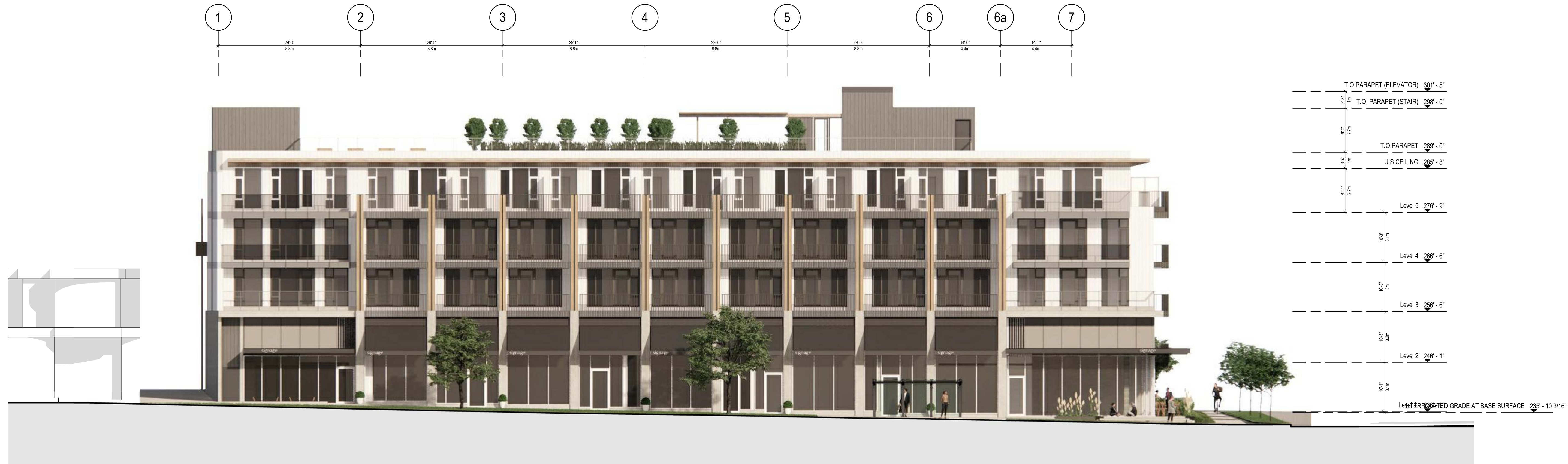
2 South Elevation Rendered A3.02 3/32" = 1'-0"