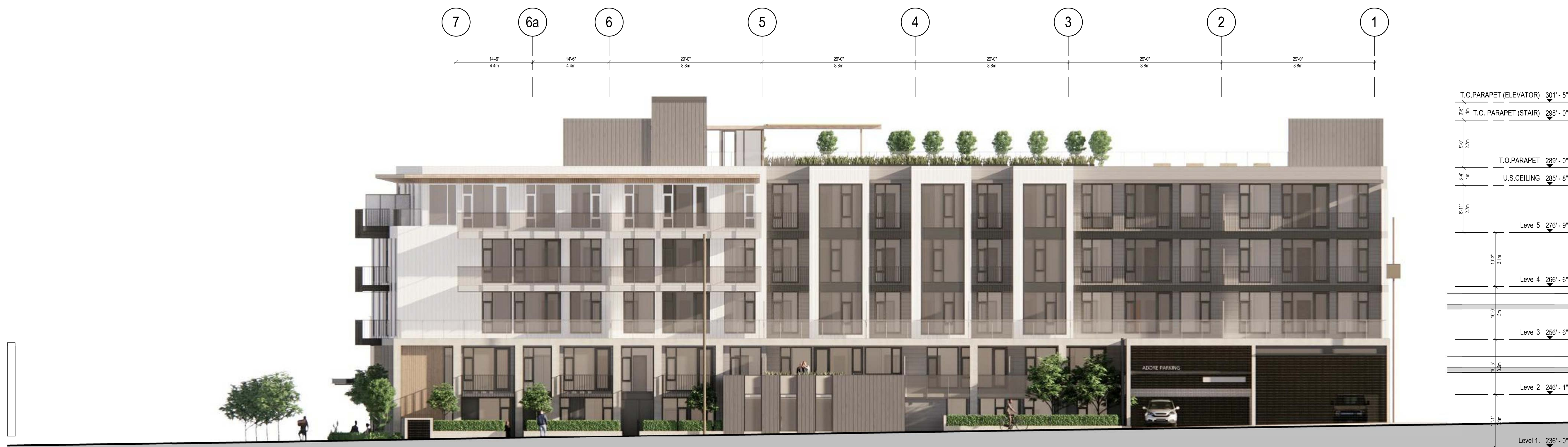
2 North Elevation Rendered A3.01 3/32" = 1'-0"