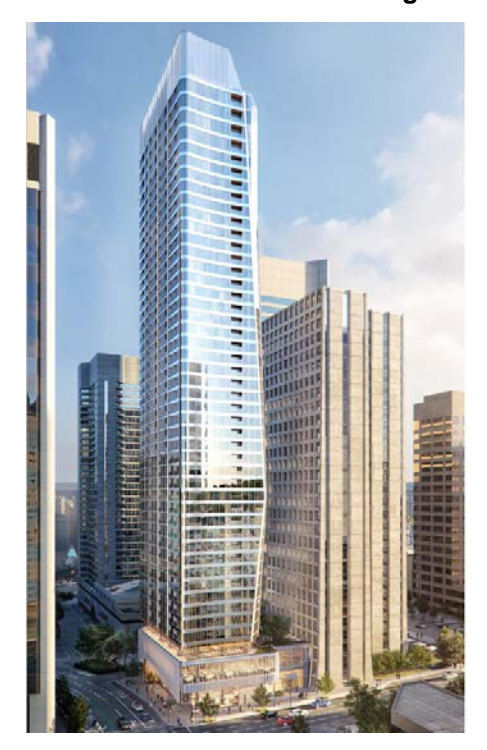
Figure 2: Proposed New Residential Tower and the existing MacMillan Bloedel Office Tower