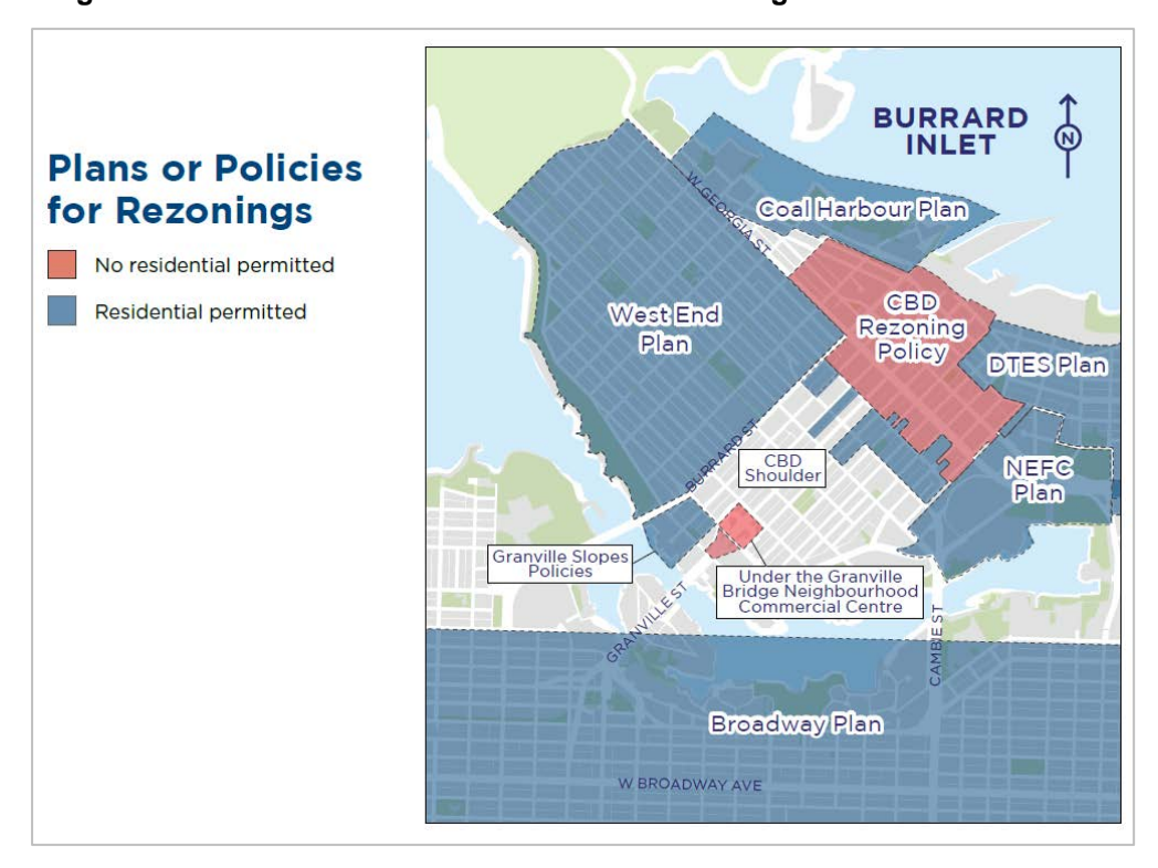
Figure 4: Plan Areas that Permit Residential Housing in the Downtown Core

identified for office and hotel uses. This could substantially limit the City's ability to grow the supply of job space in high demand areas over the long term and would result in continued upward pressure on commercial rents, impacting the diversity of employers who can afford to operate in Vancouver. In 2009, Council restricted residential development in the CBD in order to provide key commercial space in the Metro core. Today, the CBD represents a small percentage (13%) of the downtown peninsula where stand-alone office building development continues to be viable. The reintroduction of residential uses in this key commercial hub would risk destabilizing land values in the area and make commercial development less viable. Within existing City policies, there is capacity to grow rental housing outside of this core downtown area.