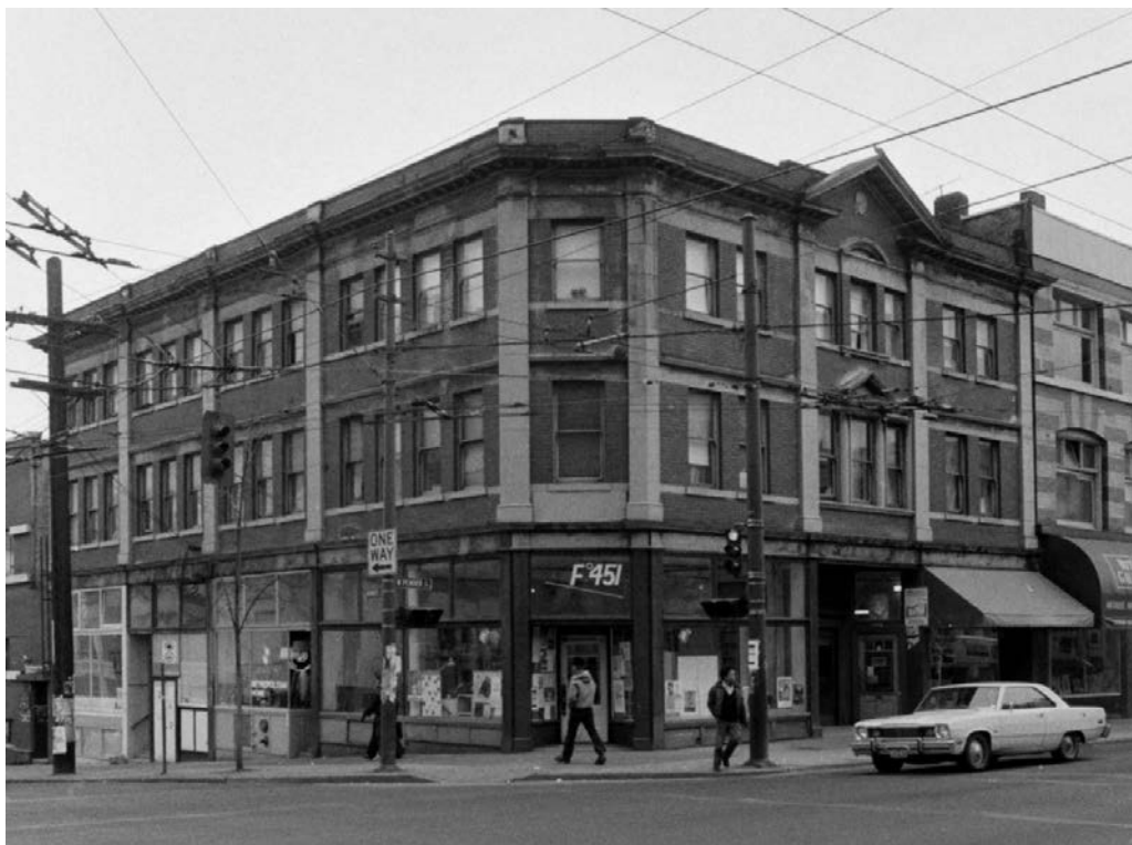
Hartney Chambers, c.1985 (CVA 790-1855)