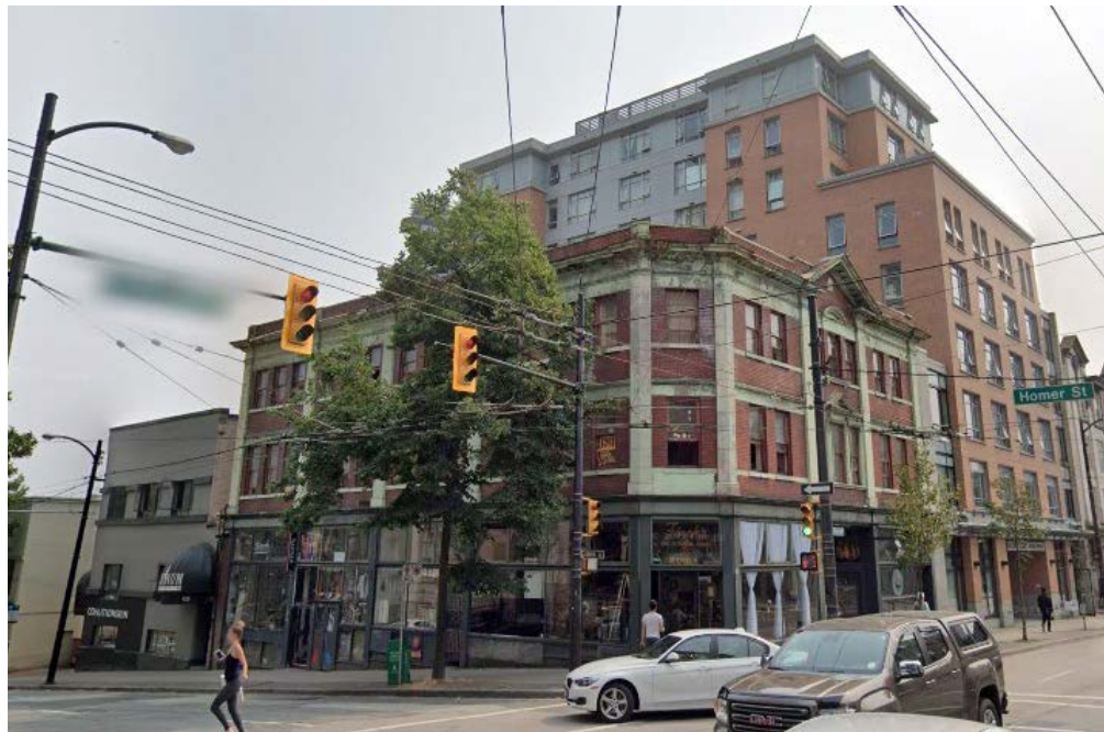
Hartney Chambers, 2020