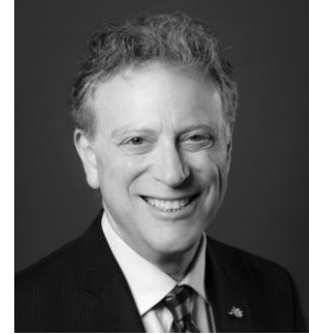
Hon. George Heyman, MLA Vancouver-Fairview