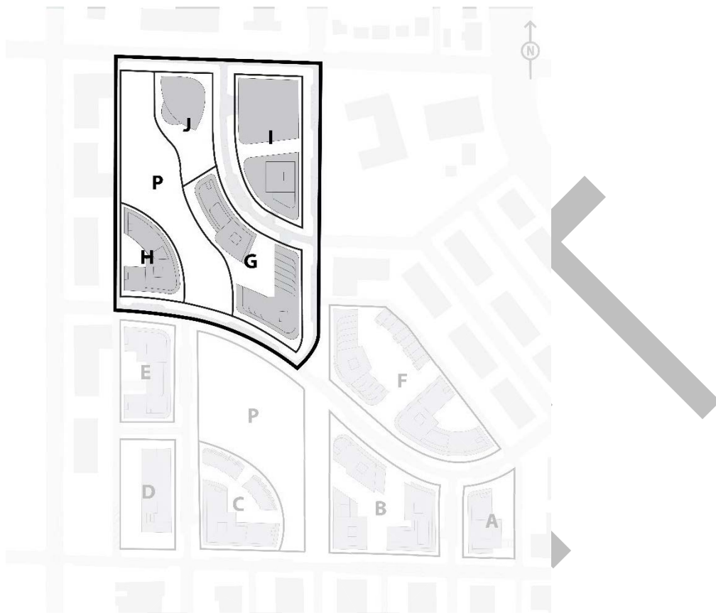
Figure 1: Sub-areas