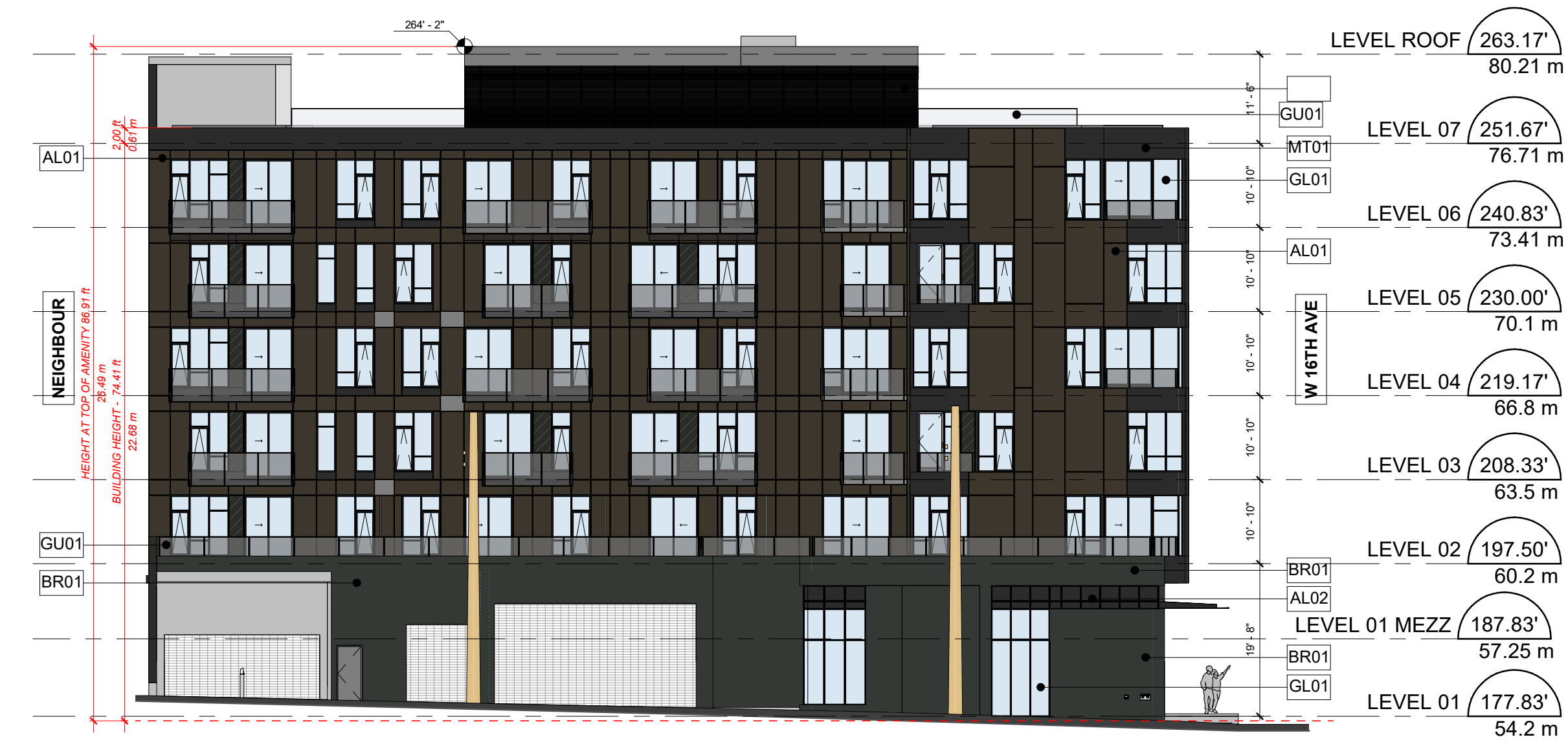
3 East Elevation - Lane Scale: 1/16" = 1'-0"