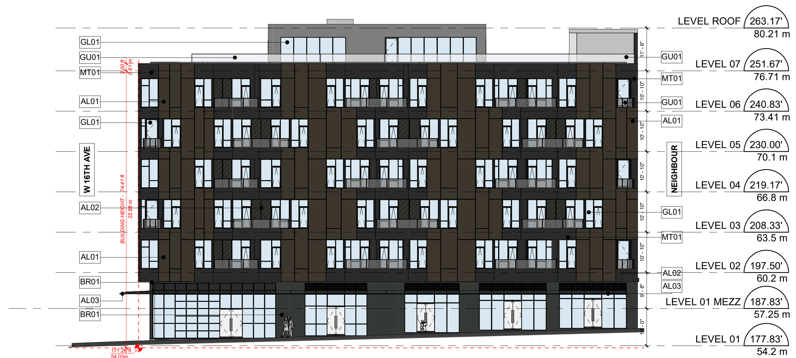
1 West Elevation - Cambie Street Scale: 1/16" = 1'-0"