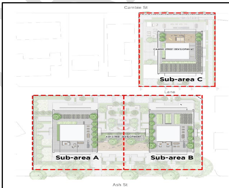
Figure 1 – Sub-areas

3. The site is to consist of three sub-areas generally as illustrated in Figure 1, solely for the purposes of establishing the permitted uses and maximum permitted building height for each sub-area.