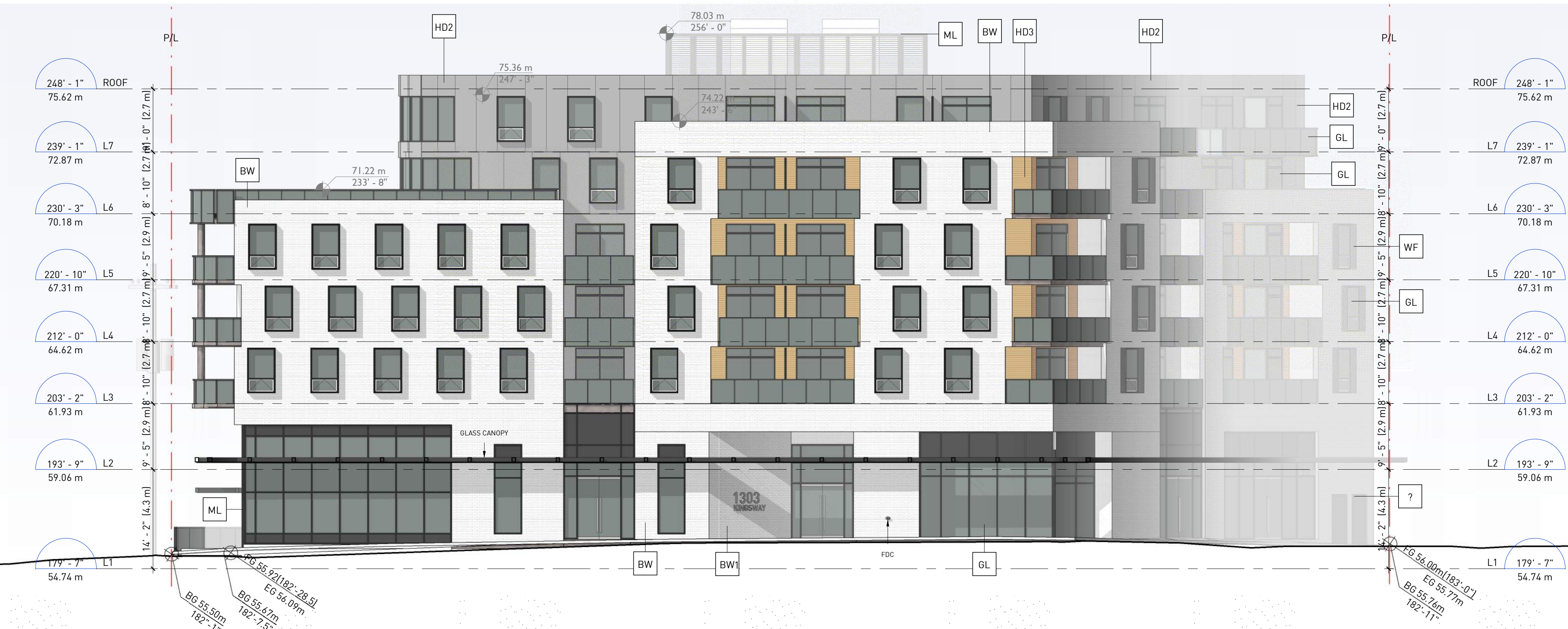
CLARK DRIVE ELEVATION