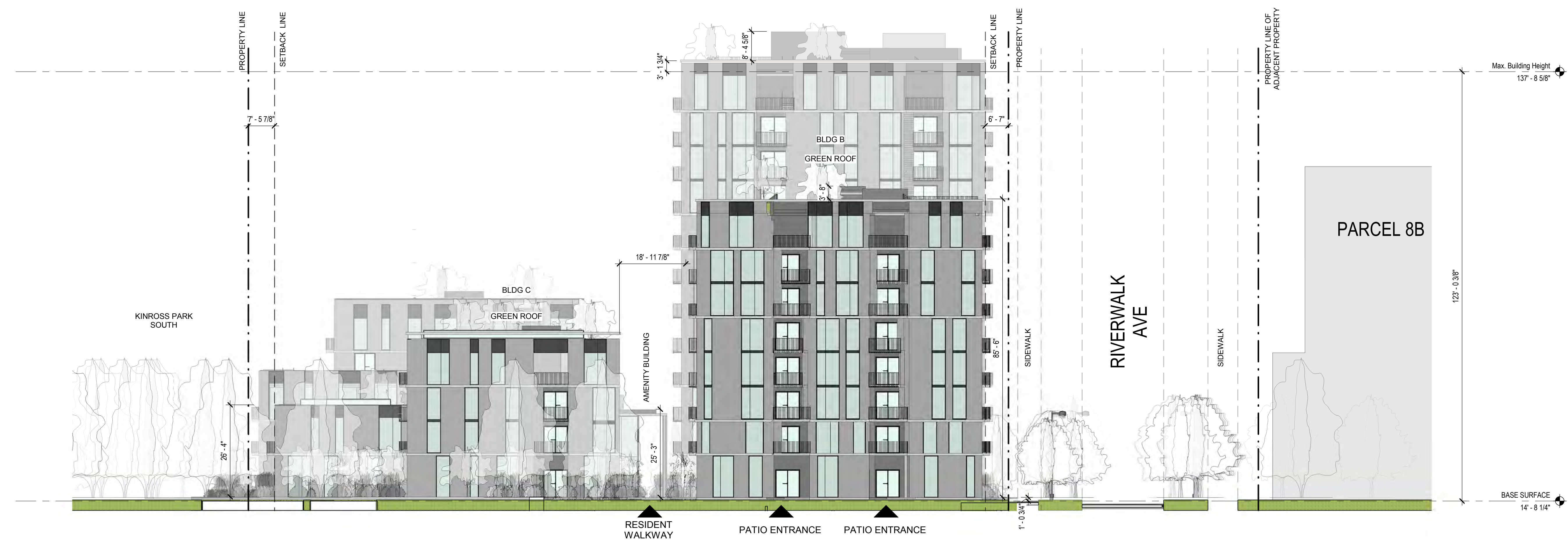
2 DP-EAST STREET ELEVATION SCALE: 1/16" = 1'-0"