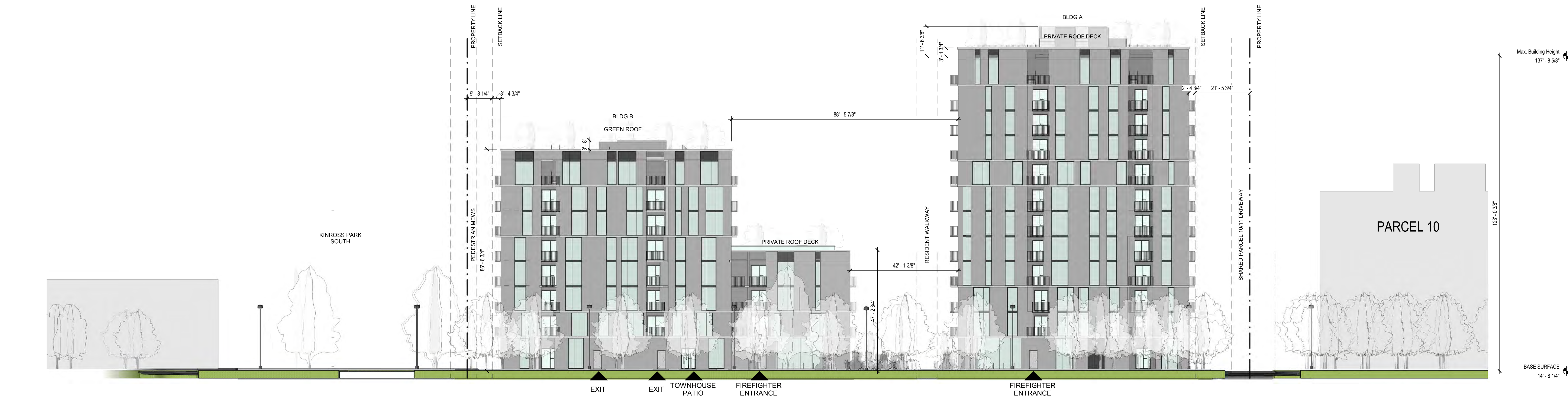
2 DP-NORTH STREET ELEVATION SCALE: 1/16" = 1'-0"