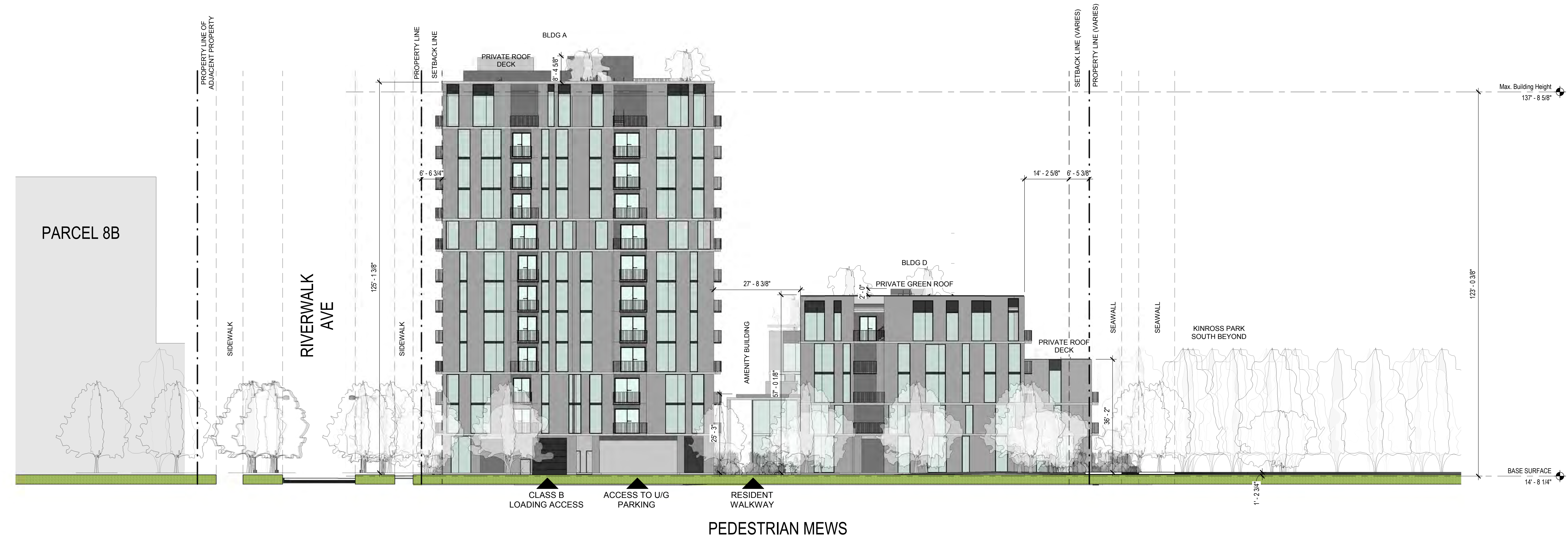
1 DP-WEST STREET ELEVATION SCALE: 1/16" = 1'-0"