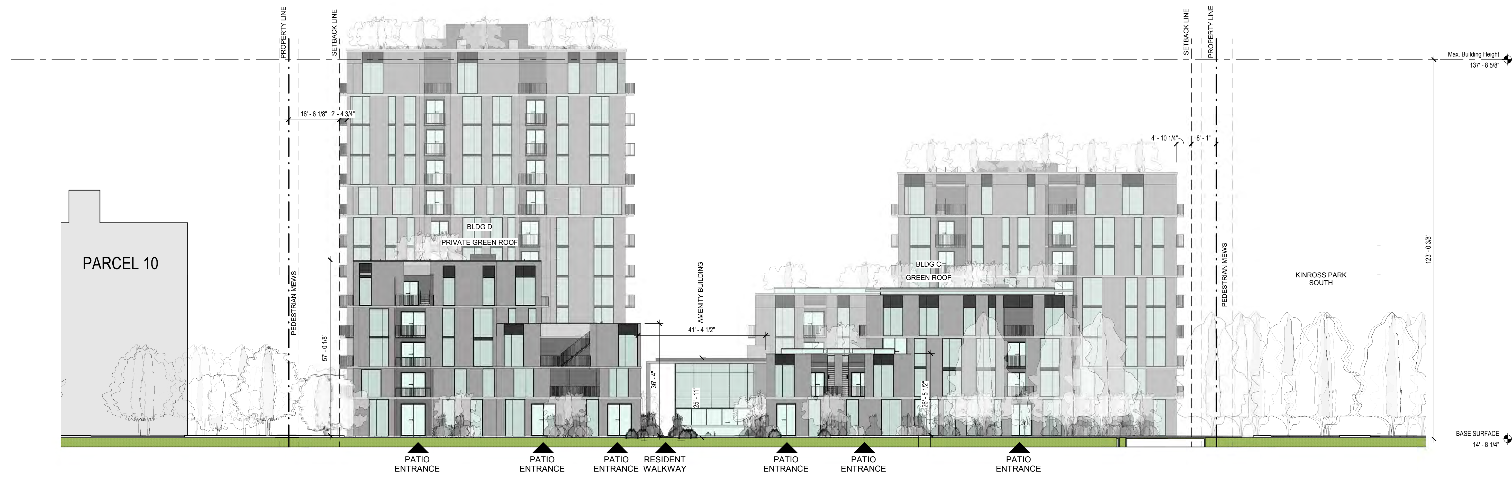
1 DP-SOUTH STREET ELEVATION SCALE: 1/16" = 1'-0"