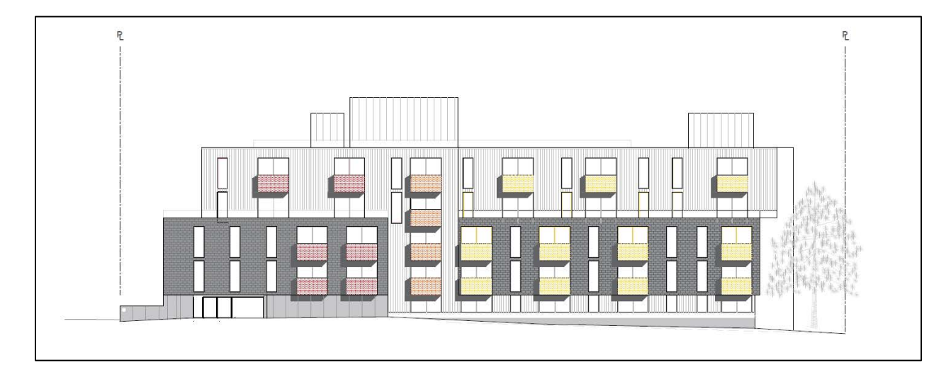
Figure 1 – South Elevation with Rooftop Indoor Amenity Space