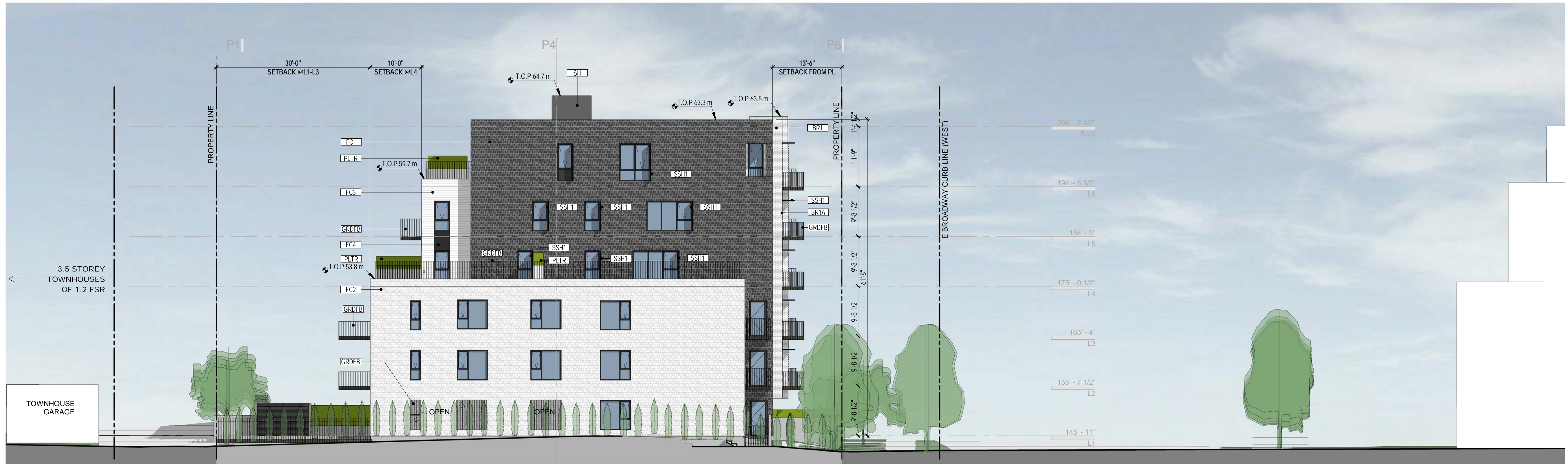
2 West 3/32" = 1'-0"