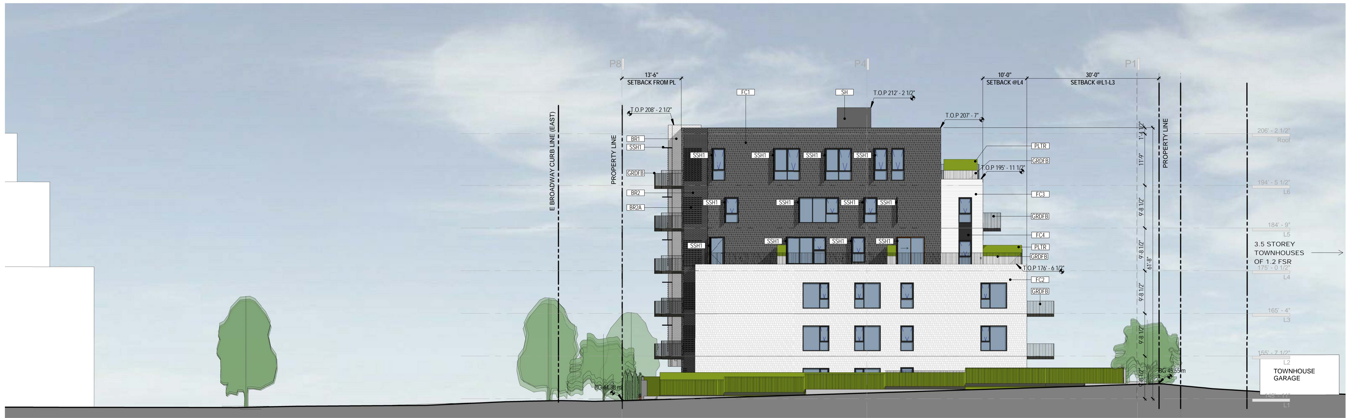
1 East 3/32" = 1'-0"