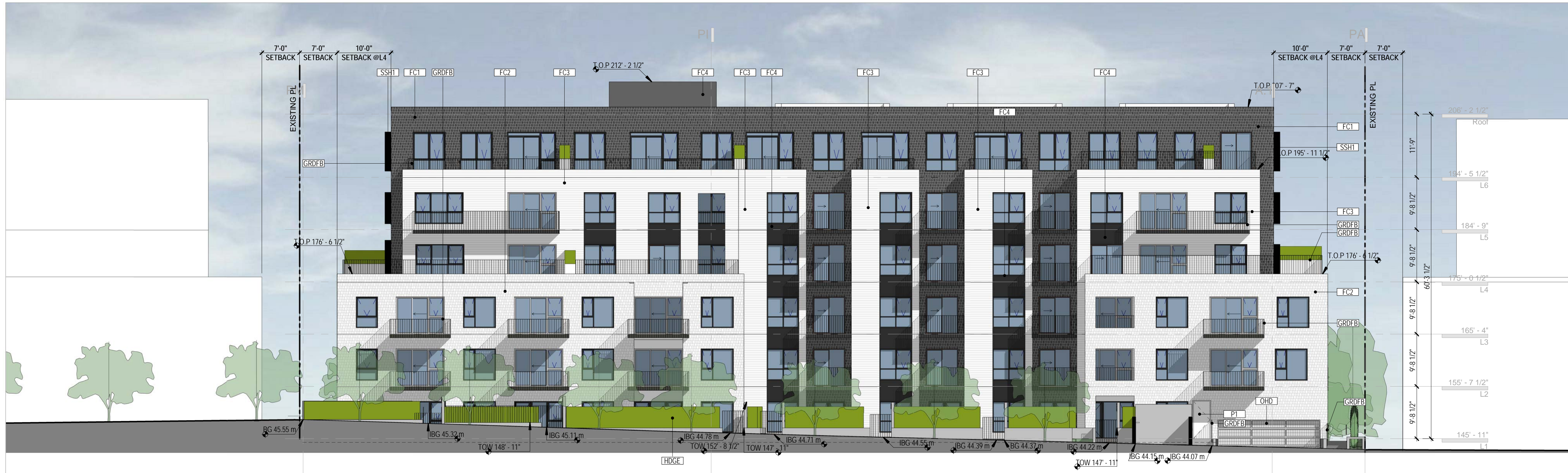
1 North (Laneway)