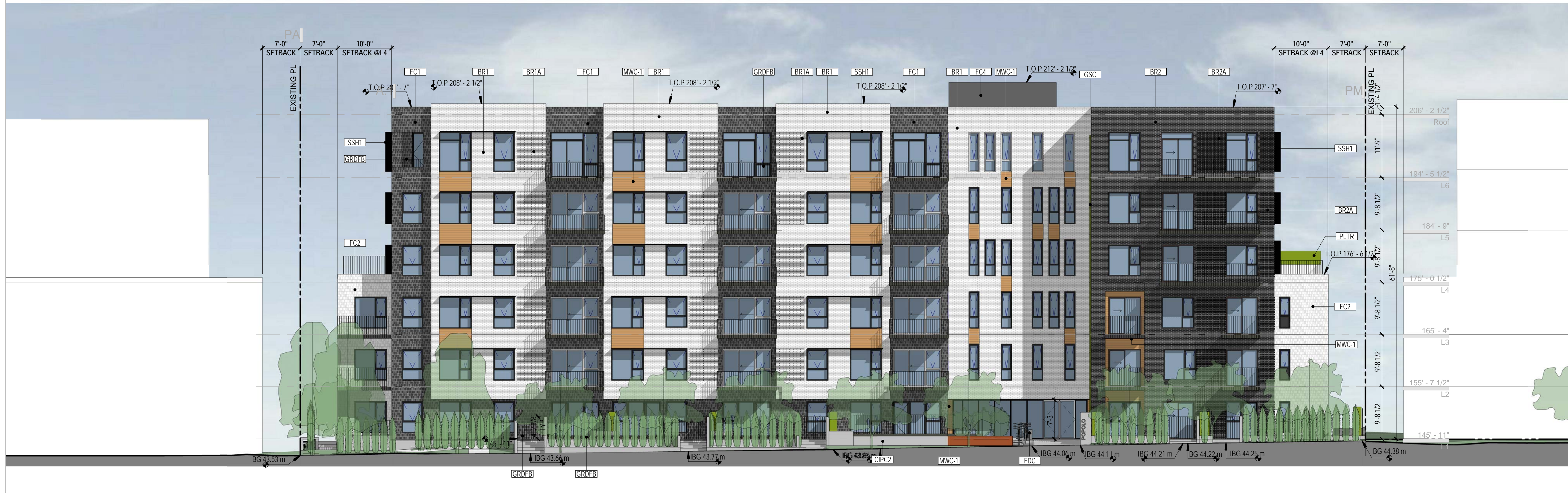
2 South (Broadway)