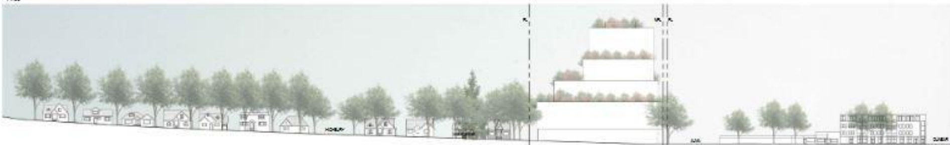
4 STREETScape ELEVATION