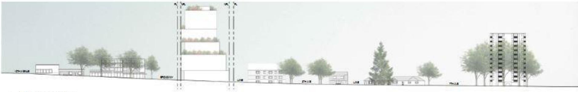
3 STREETScape ELEVATION