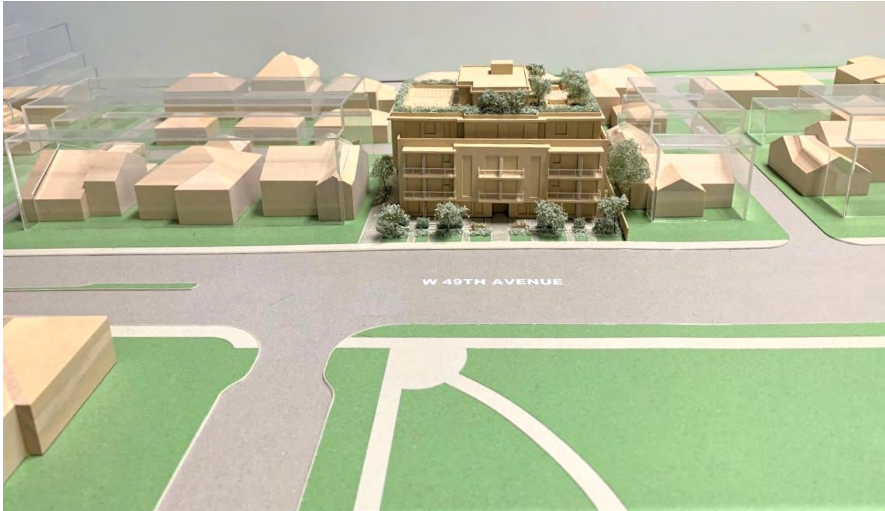
MODEL PHOTO 1