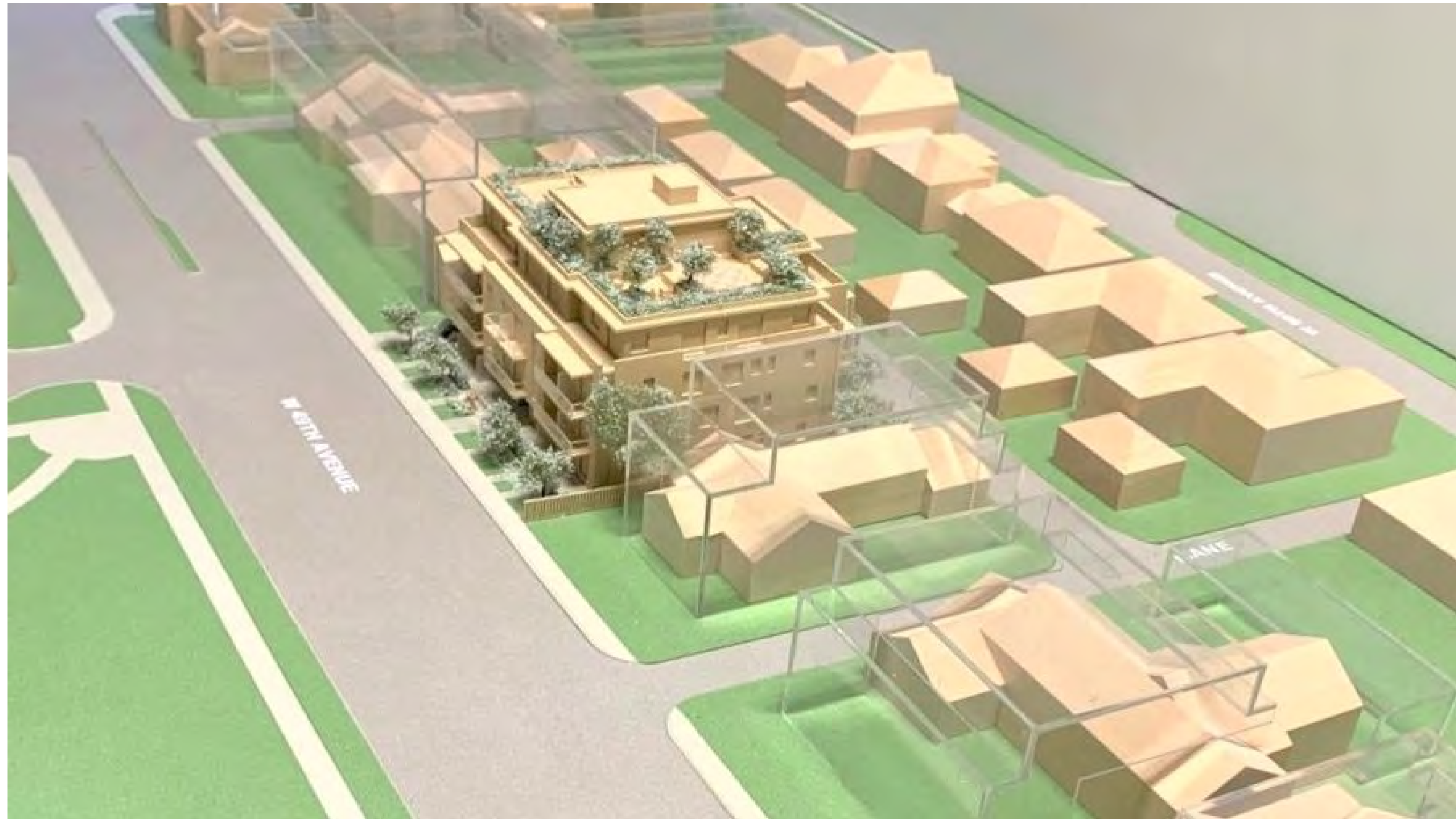
MODEL PHOTO 4

THIS DOCUMENT HAS BEEN ELECTRONICALLY CERTIFIED WITH DIGITAL CERTIFICATE AND ENCRYPTION TECHNOLOGY AUTHORIZED BY THE AIBC AND APEGBC. THE AUTHENTIC ORIGINAL IS IN ELECTRONIC FORM TRANSMITTED TO YOU. ANY PRINTED VERSION CAN BE RELIED UPON AS A TRUE COPY OF THE ORIGINAL WHEN SUPPLIED BY THE ORIGINAL AUTHOR, BEARING IMAGES OF THE PROFESSIONAL SEAL AND DIGITAL CERTIFICATE OR WHEN PRINTED FROM THE DIGITALLY CERTIFIED ELECTRONIC FILE SENT TO YOU.