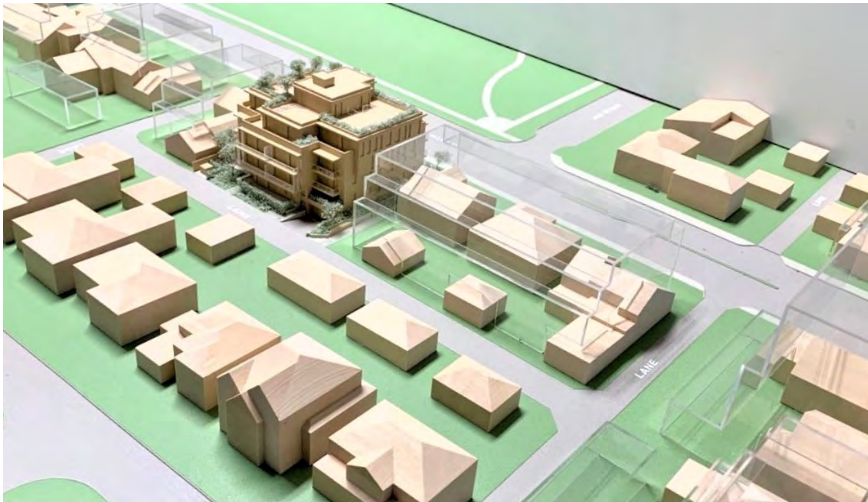
MODEL PHOTO 7