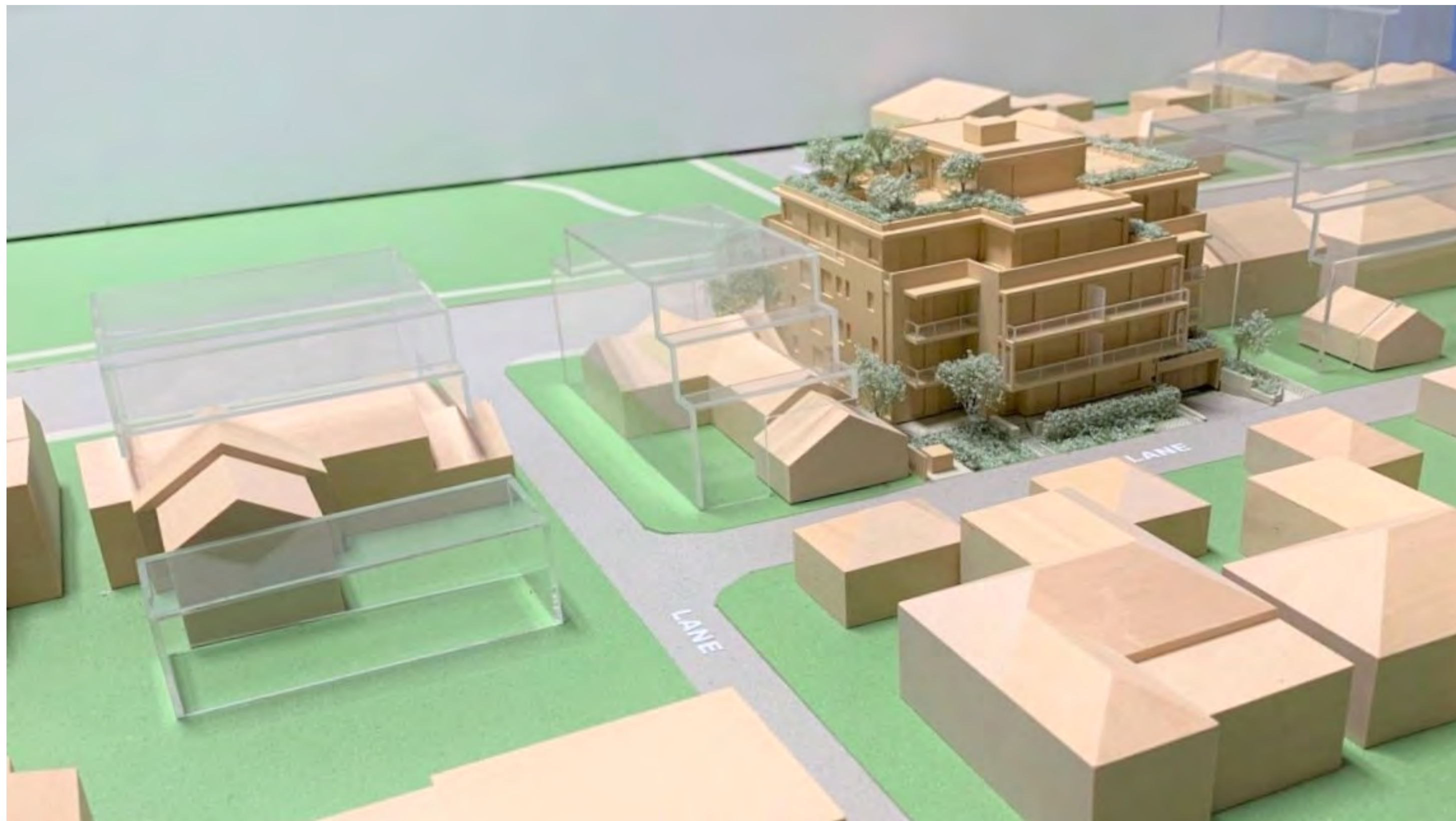
MODEL PHOTO 8

THIS DOCUMENT HAS BEEN ELECTRONICALLY CERTIFIED WITH DIGITAL CERTIFICATE AND ENCRYPTION TECHNOLOGY AUTHORIZED BY THE AIBC AND APEGBC. THE AUTHENTIC ORIGINAL IS IN ELECTRONIC FORM TRANSMITTED TO YOU. ANY PRINTED VERSION CAN BE RELIED UPON AS A TRUE COPY OF THE ORIGINAL WHEN SUPPLIED BY THE ORIGINAL AUTHOR, BEARING IMAGES OF THE PROFESSIONAL SEAL AND DIGITAL CERTIFICATE OR WHEN PRINTED FROM THE DIGITALLY CERTIFIED ELECTRONIC FILE SENT TO YOU.