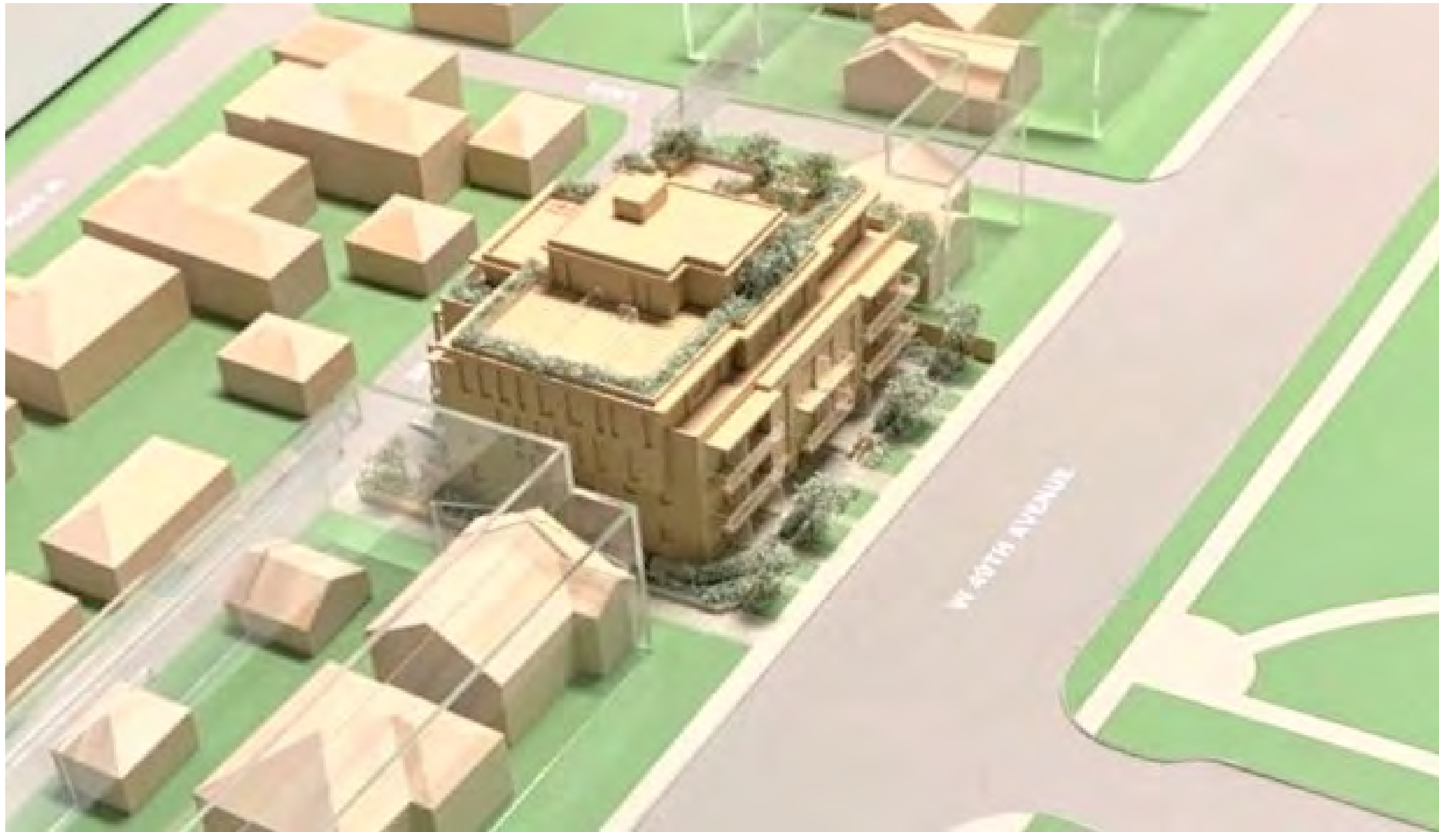
MODEL PHOTO 3