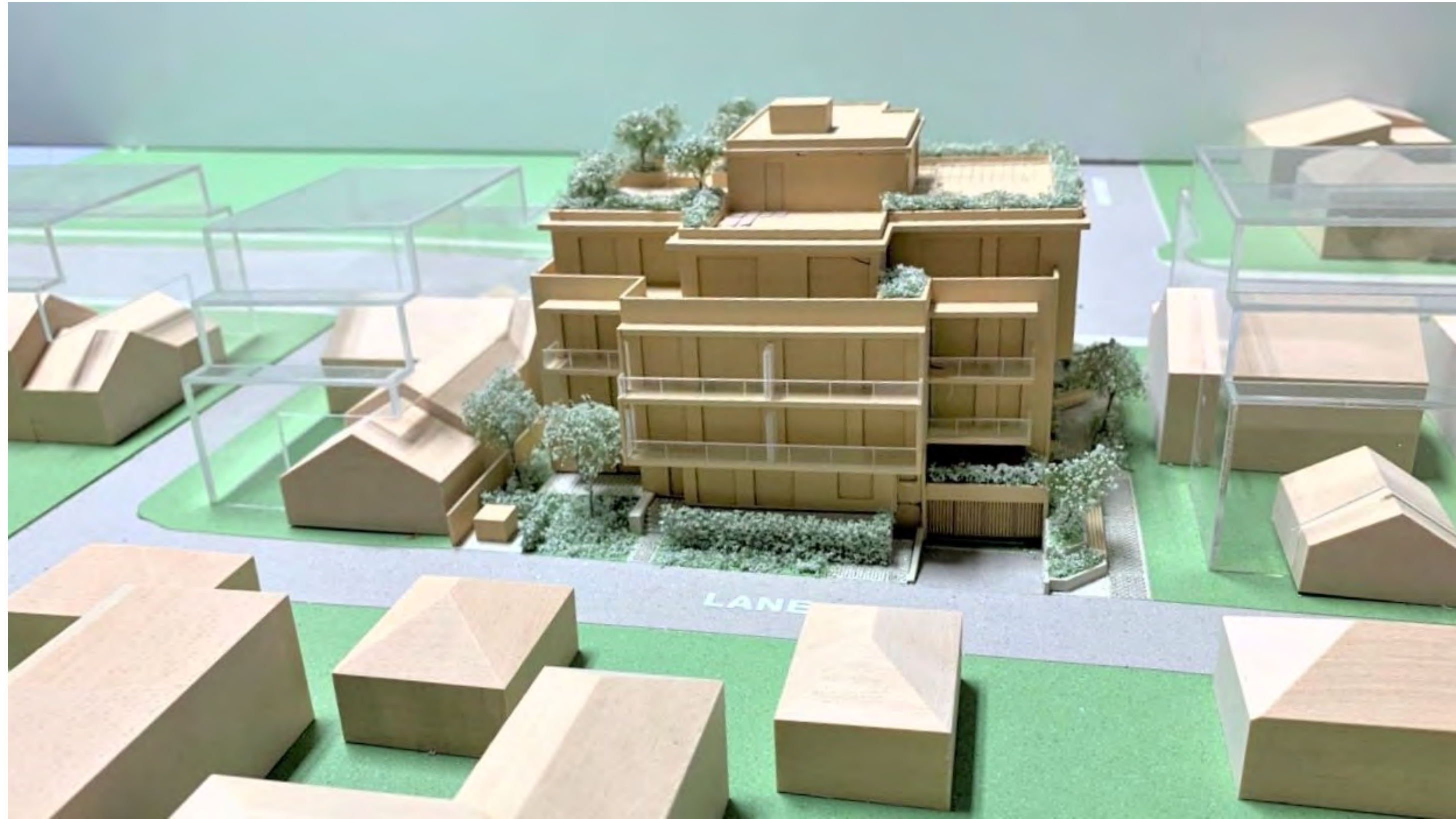
MODEL PHOTO 6