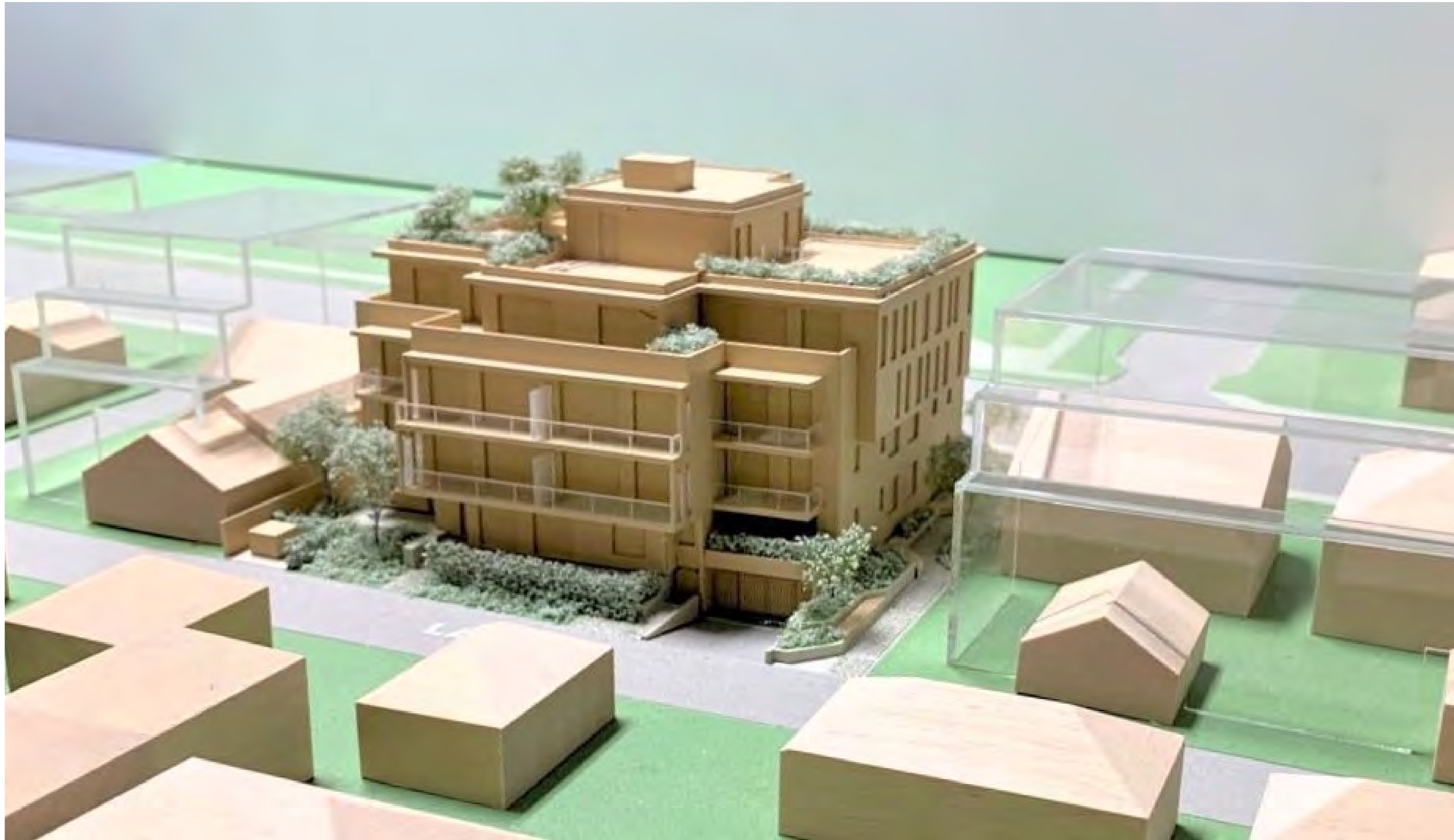
MODEL PHOTO 5