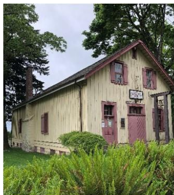
Gutters and drainpipes renewal

Seven projects have now completed to date.