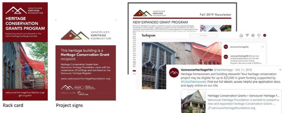
Samples of communications, 2019-20, Heritage Conservation Grants Program.

In December 2019, program information was mailed directly to over 1,300 properties on the Vancouver Heritage Register. Twenty lawn signs were designed and printed for display at grantee projects.