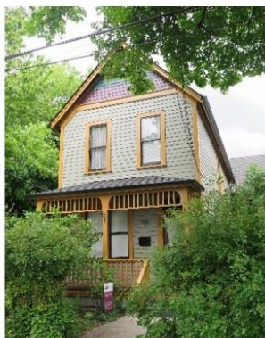
Historical paint palette restoration – two houses