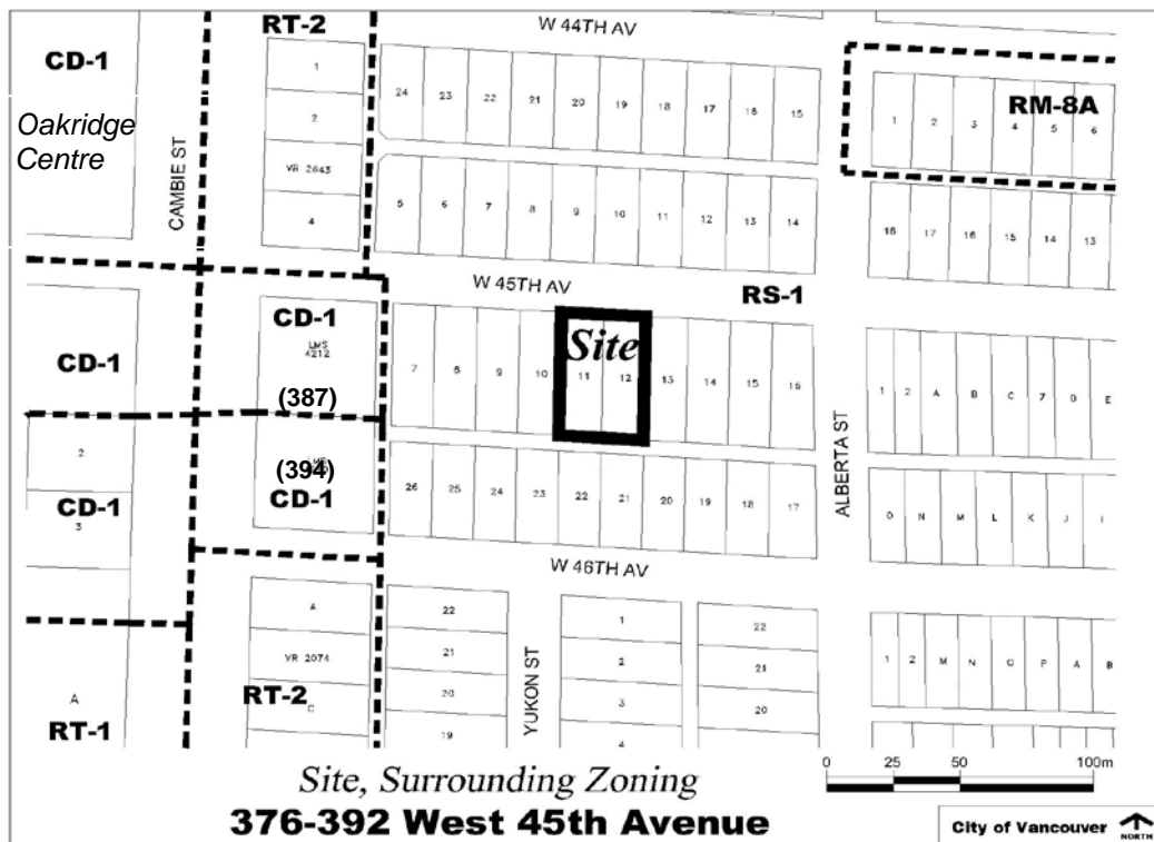
Figure 1: Location Map - Site and Context

The two single-family houses on site were constructed in 1949 and 1987 and do not have heritage designations, nor are they listed on the Vancouver Heritage Register.