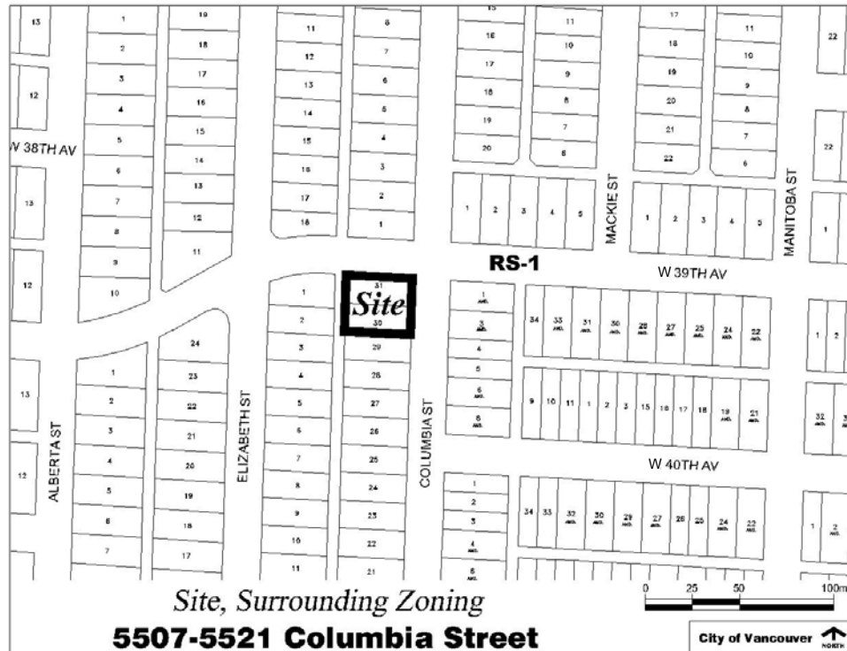
Figure 1: Location Map - Site and Context

developed with two single-family homes. A similar single-family home neighbourhood currently surrounds the site, although the area is anticipated to transition towards higher-density residential developments in coming years (see '2. Policy Context'). Queen Elizabeth Park and the Midtown/Ridgeway bikeway are two blocks to the north