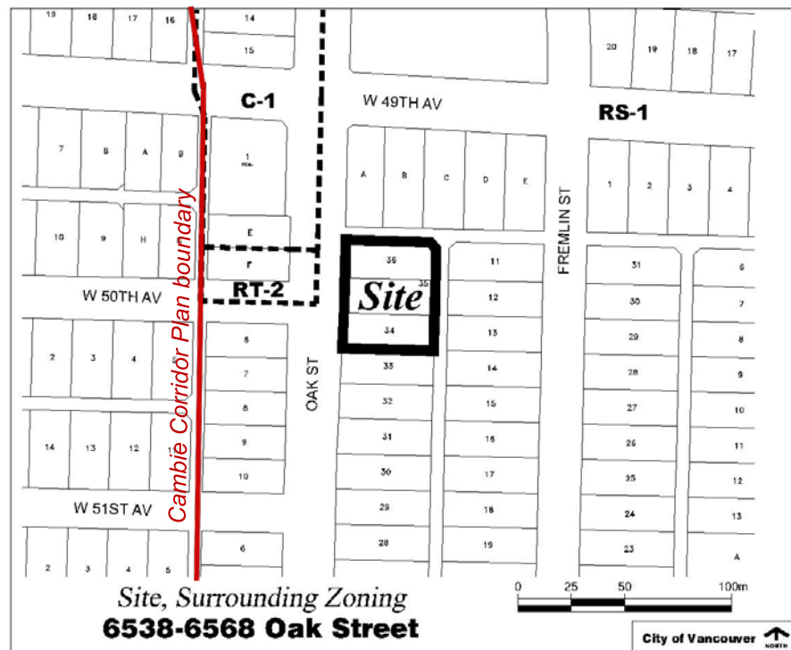
Figure 1: Location Map - Site and Context

The subject site is located on the east side of Oak Street and next to a lane that is south of West 49th Avenue (see Figure 1). The site is comprised of three legal parcels fronting Oak Street. The total site size is 2,144 sq. m (23,088 sq. ft.), with a combined frontage of approximately 51 m (166 ft.) along Oak Street and a depth of 42 m (139 ft.). The site is currently zoned RS-1 and developed with three single-family homes. A similar single-family home neighbourhood context surrounds the site with low-density commercial uses at corner of West 49th Avenue and Oak Street. Five other RM-8A/AN townhouse rezonings have been approved along Oak Street in recent months a few blocks to the north and south of the site (outside the map context).