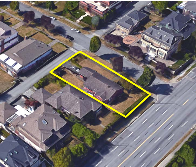
1008 West 52nd Avenue