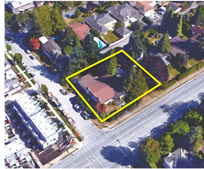
6218-6230 Oak Street