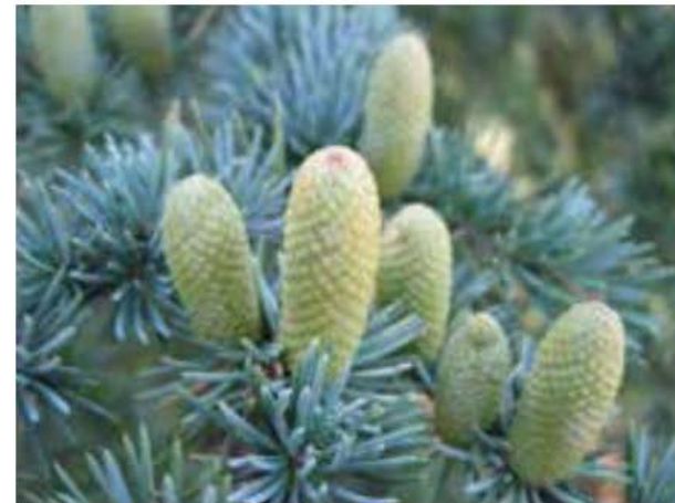
Atlas Blue Cedar