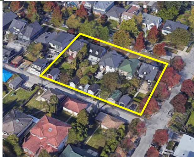
404-434 West 23rd Avenue