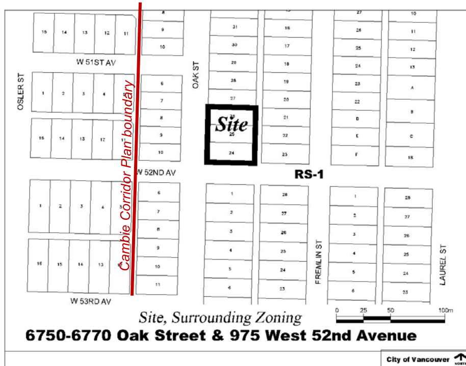
Figure 1: Location Map - Site and Context

(24,298 sq. ft.), with a combined frontage of approximately 51 m (167 ft.) along Oak Street and a depth of 44 m (144 ft.) along West 52nd Avenue. The site is currently zoned RS-1 and developed with single-family homes. A similar single-family home neighbourhood context surrounds the site.