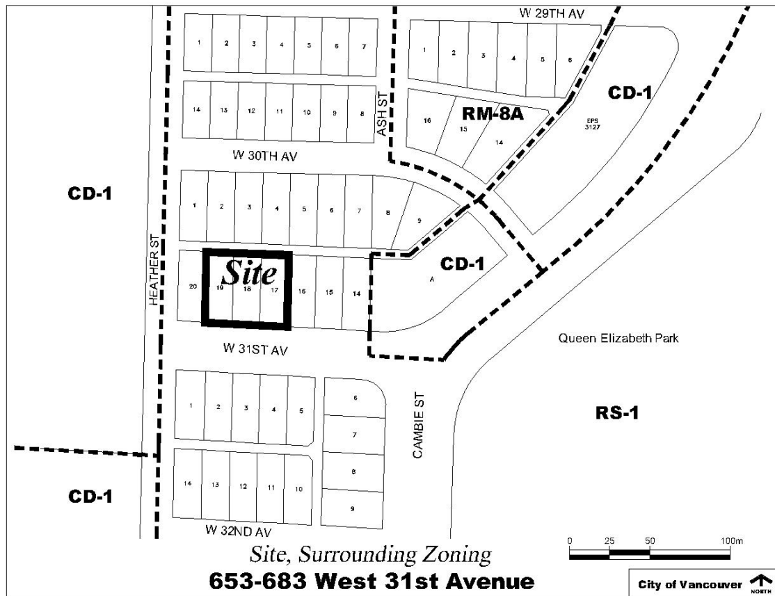
Figure 1: Location Map - Site and Context

The site is currently zoned RS-1 and developed with single-family homes. A similar single-family neighbourhood context surrounds the site. The Ronald McDonald House BC and BC Children's Hospital are to the west of the site across Heather Street. To the east of the site along Cambie Street is an approved six-storey residential building.