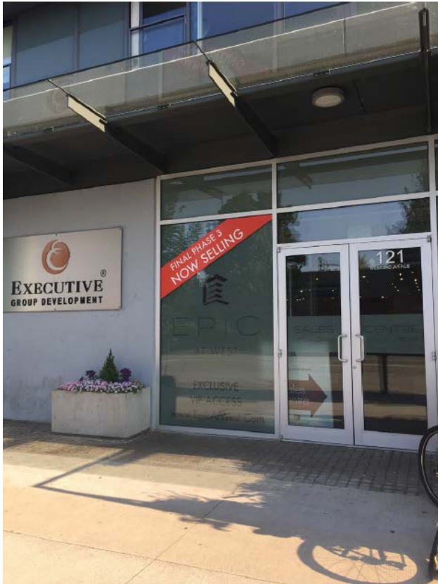
Fitness Centre at 121 W 2nd Ave