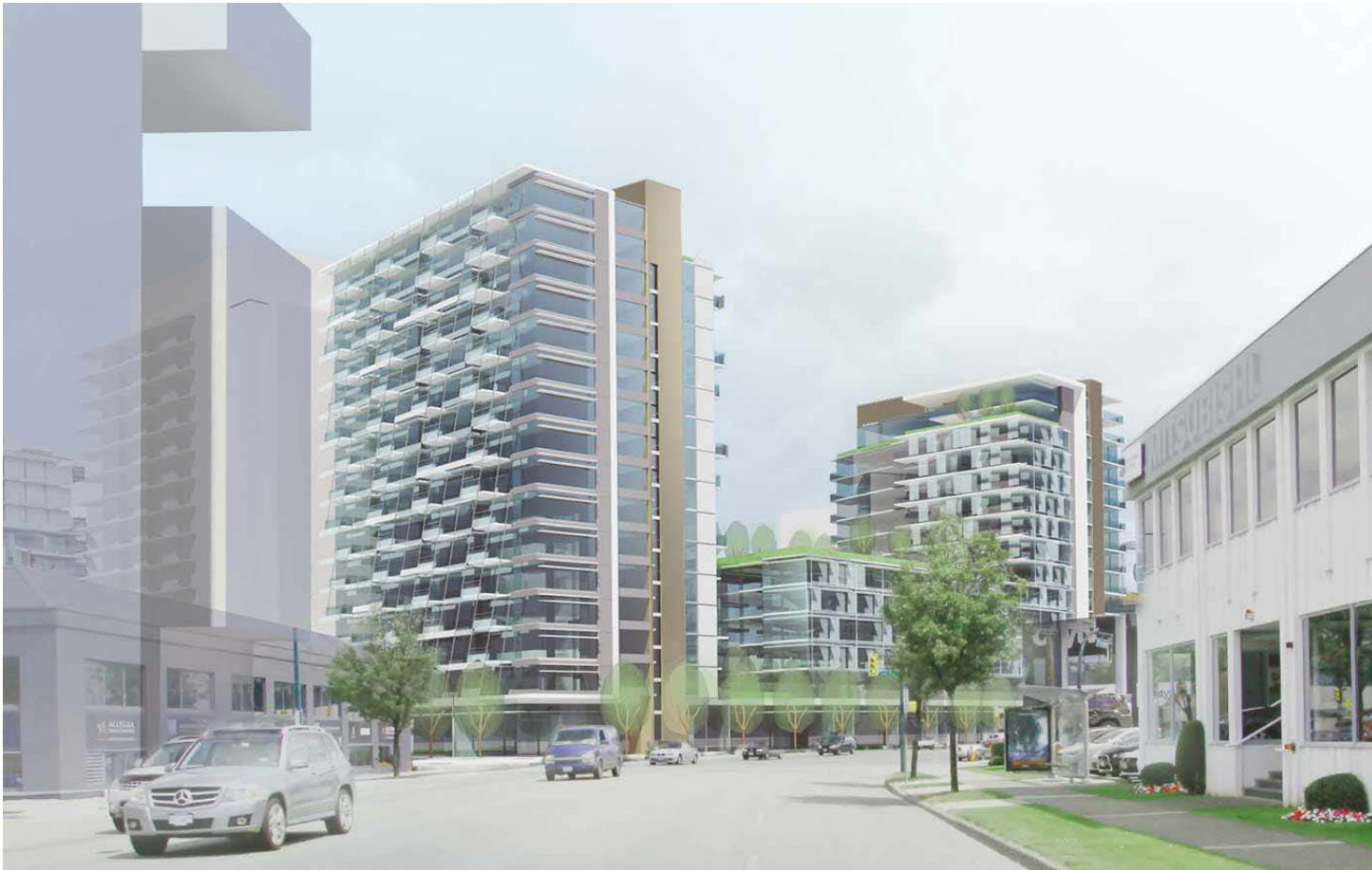
Original CD-1 Rezoning Rendering