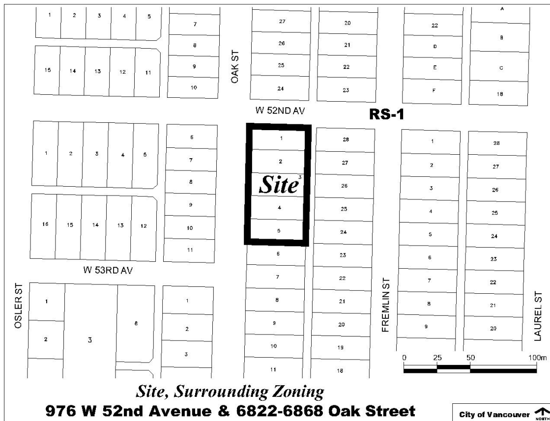
Figure 1: Location Map - Site and Context