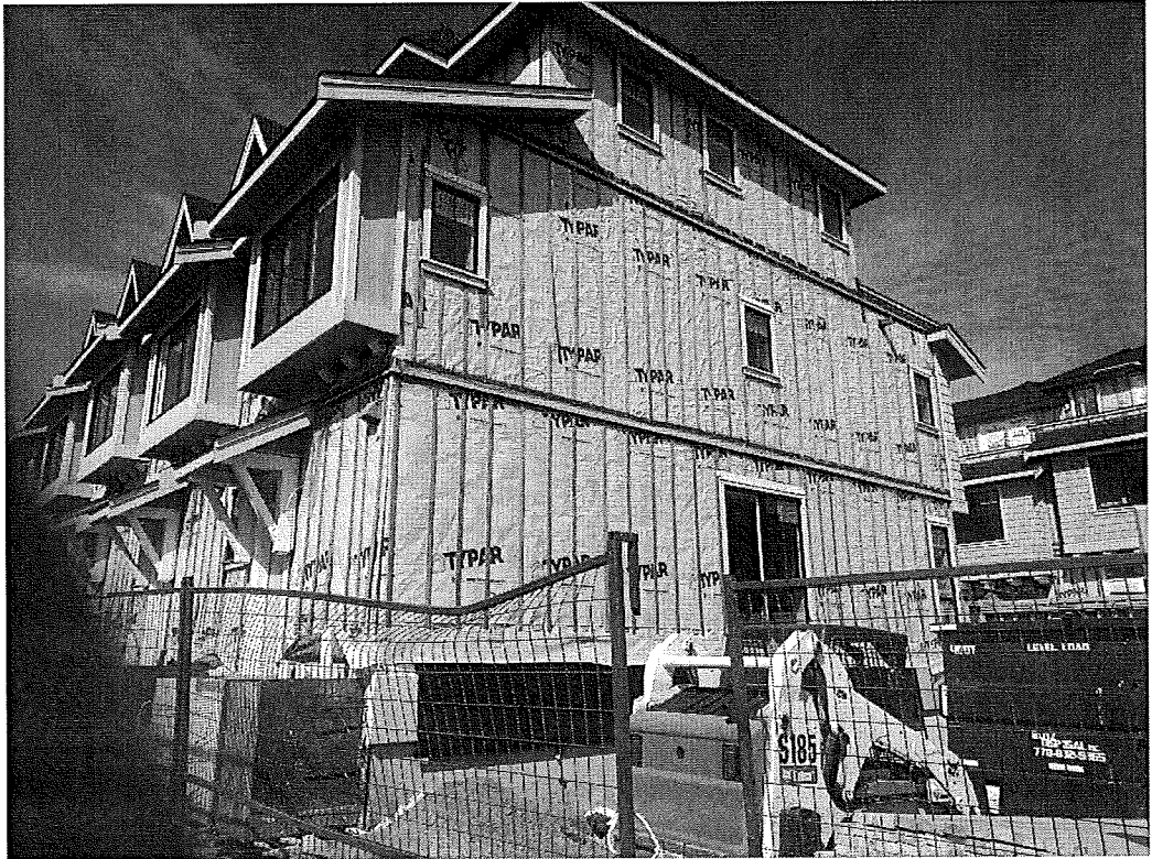
8101 Shaughnessy St. North Side, Link: http://i65.tinypic.com/avl7h5.jpg