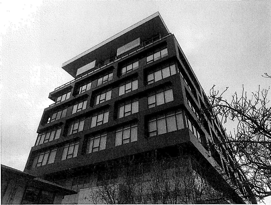
6677 Cambie North Side, Link: http://i65.tinypic.com/29wqycl.jpg