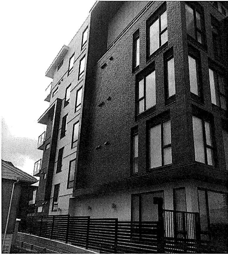
611 West 41st East Side, Link: http://i65.tinypic.com/2w2r1ow.jpg