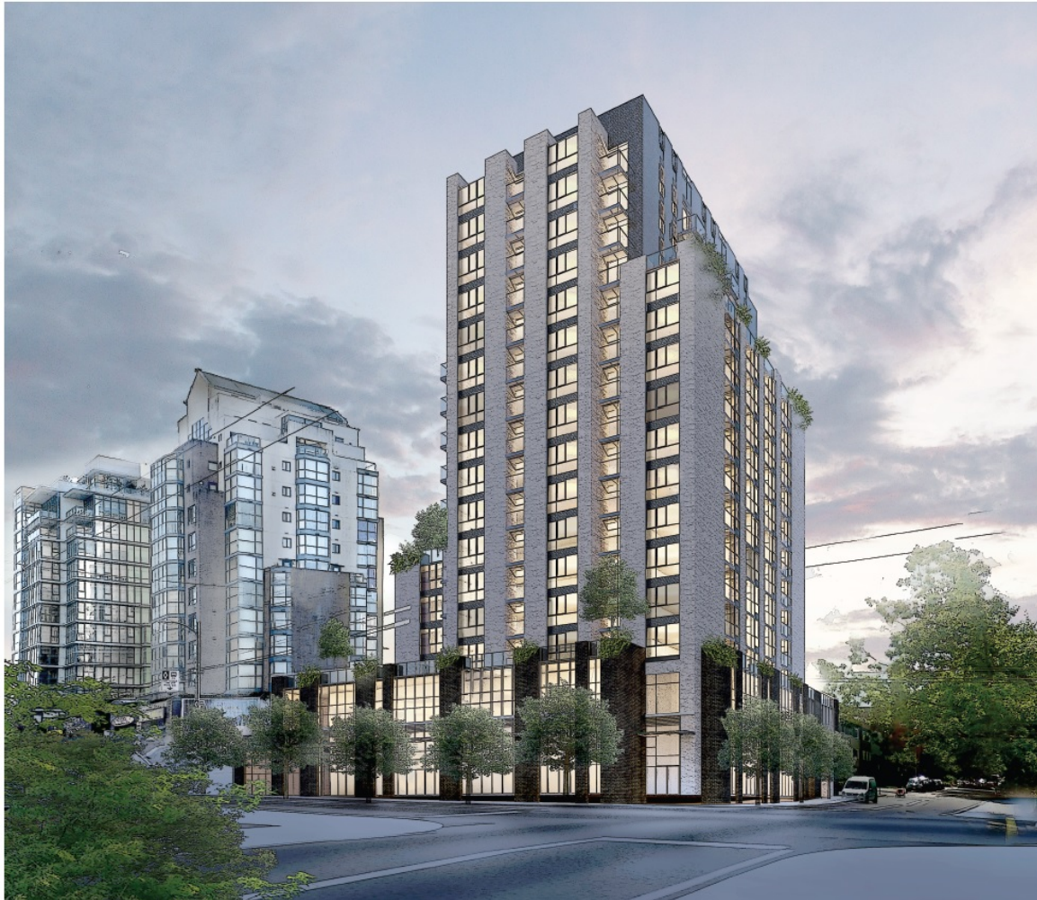
CD-1 Rezoning: 1296 West Broadway