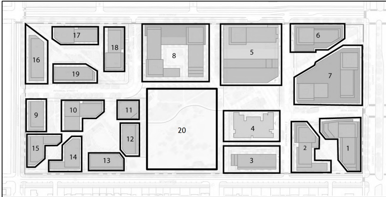
Figure 2: Sub Areas for Maximum Permitted Building Storeys and Building Height