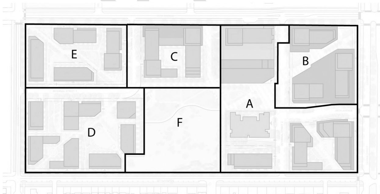
Figure 1: Sub-Areas for Maximum Permitted Floor Area and Permitted Uses

2.2 The site is to consist of twenty sub-areas generally as illustrated in Figure 2, solely for the purpose of establishing maximum permitted building storeys and building height.