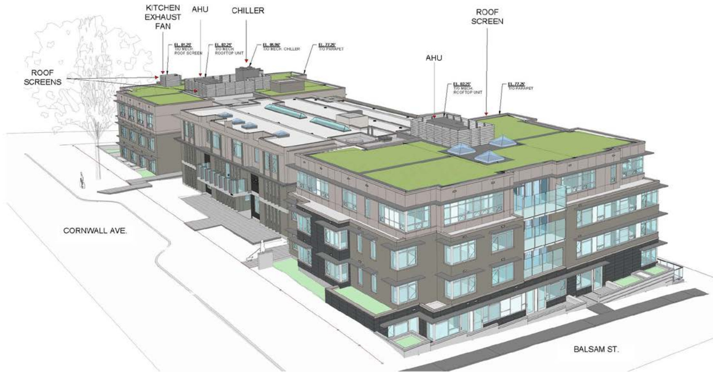
Point Grey Private Hospital Expansion 2423 Cornwall Ave.