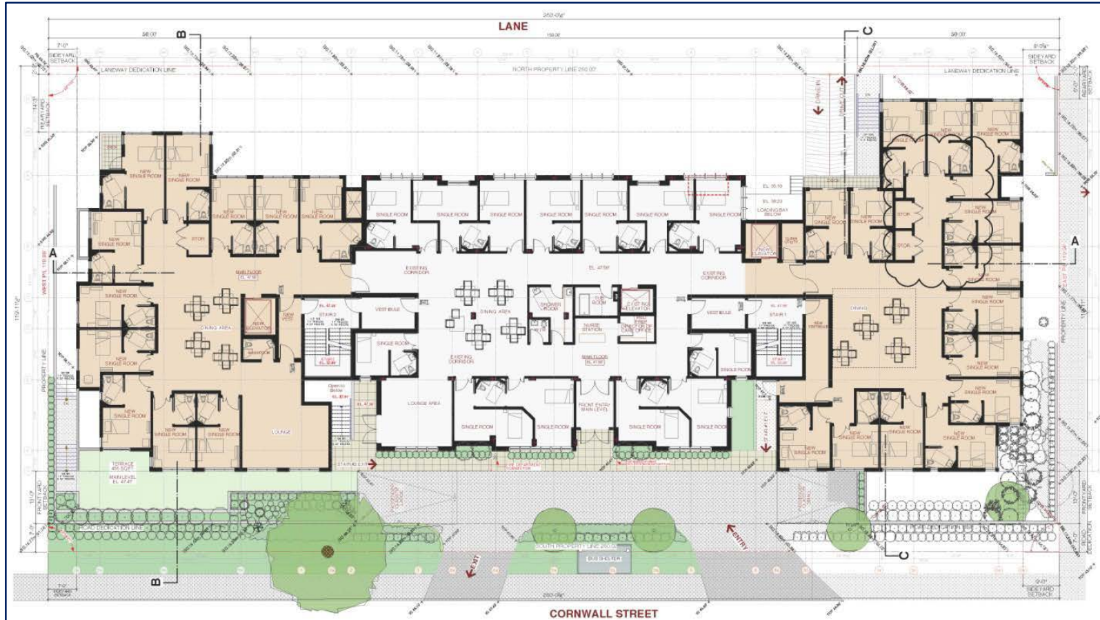
2014 Council Approval: main floor plan showing retained hospital and new east/west additions