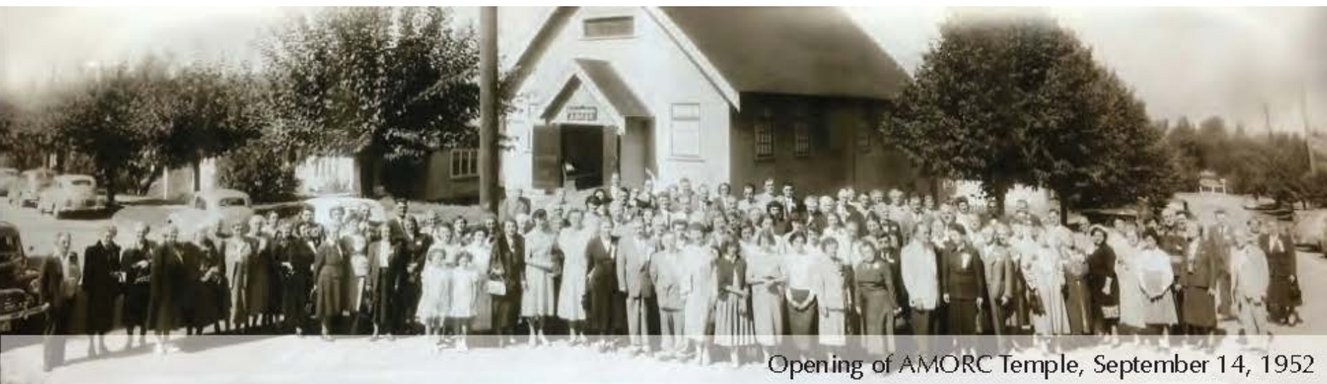
Opening of AMORC Temple, September 14, 1952

CD-1 Rezoning and Heritage Designation: 809 West 23rd Avenue Public Hearing | June 13, 2017