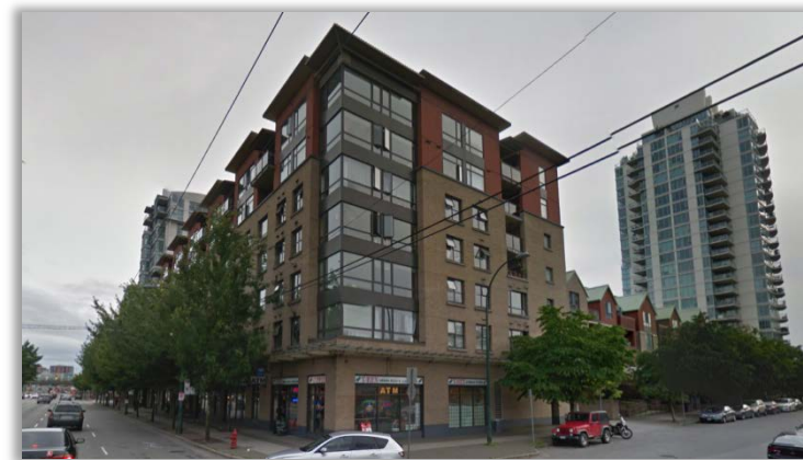
City Gate Co-op