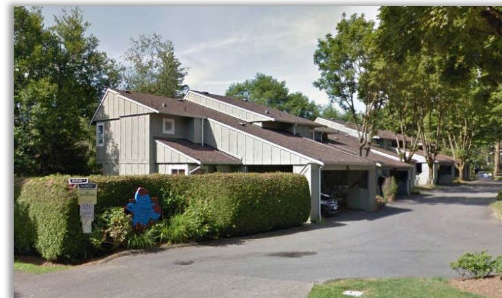
Matheson Heights Co-op