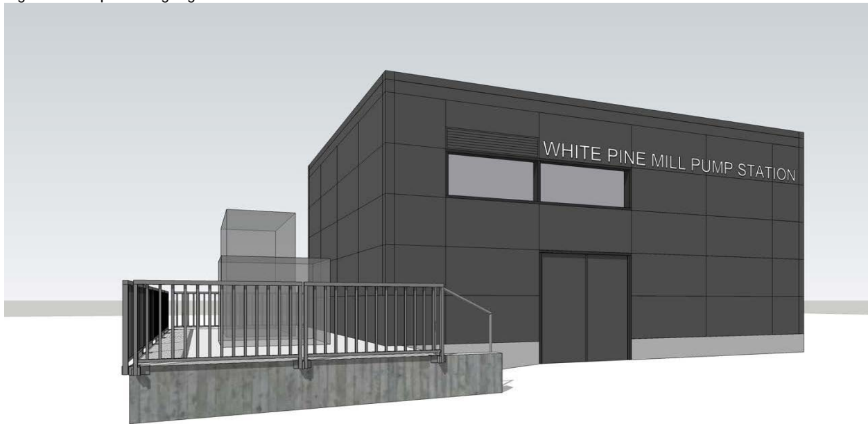
Figure 1: Proposed Signage