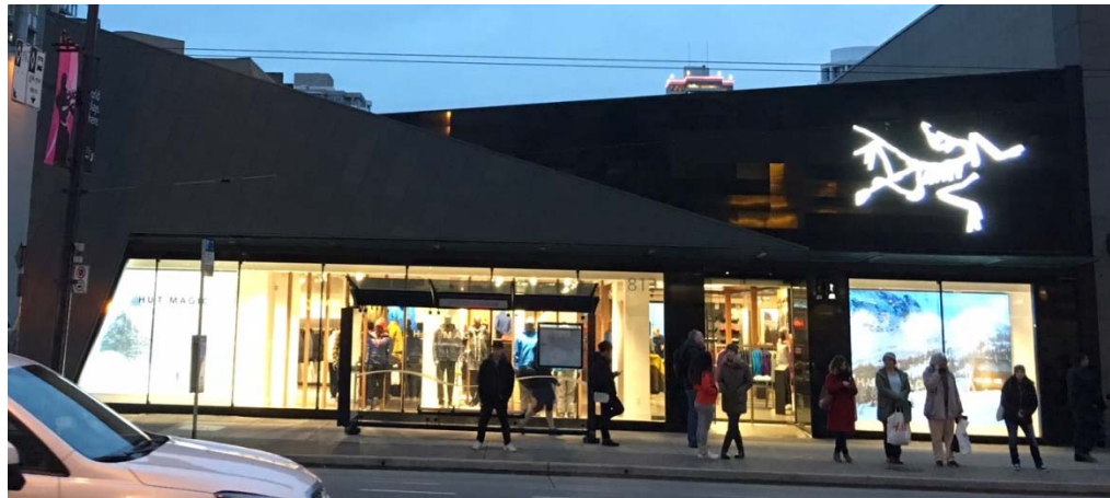
Figure 2: View of existing fascia sign