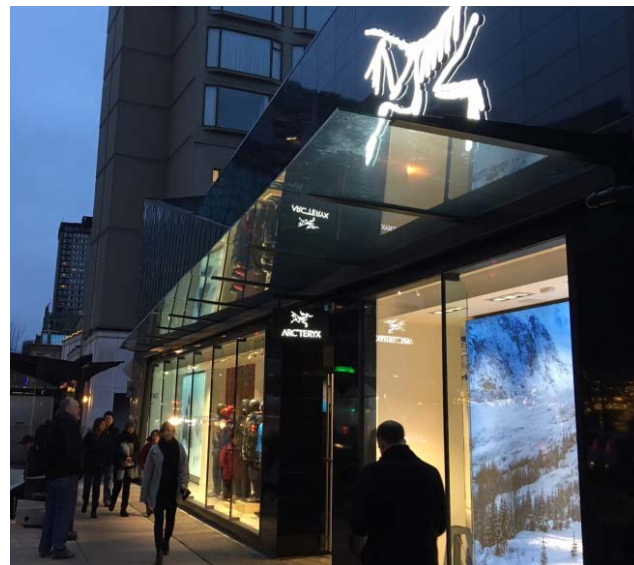
Figure 3: View of existing projecting sign

One fascia sign, located on the side wall facing the lane, did not comply with the Sign By-law. The Sign By-law only allows a fascia sign to face a lane if there is a public entrance to the premises on the lane.