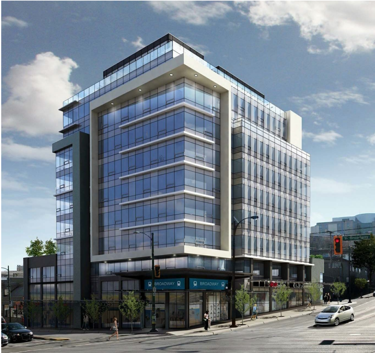
View of amended building proposal looking southeast